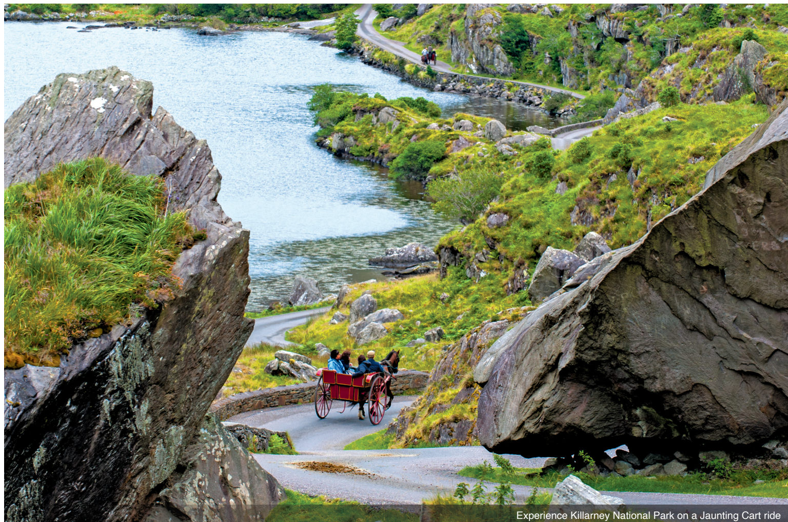
Experience Killarney National Park on a Jaunting Cart ride