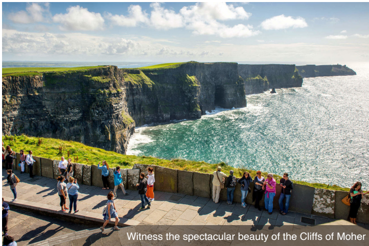
Witness the spectacular beauty of the Cliffs of Moher