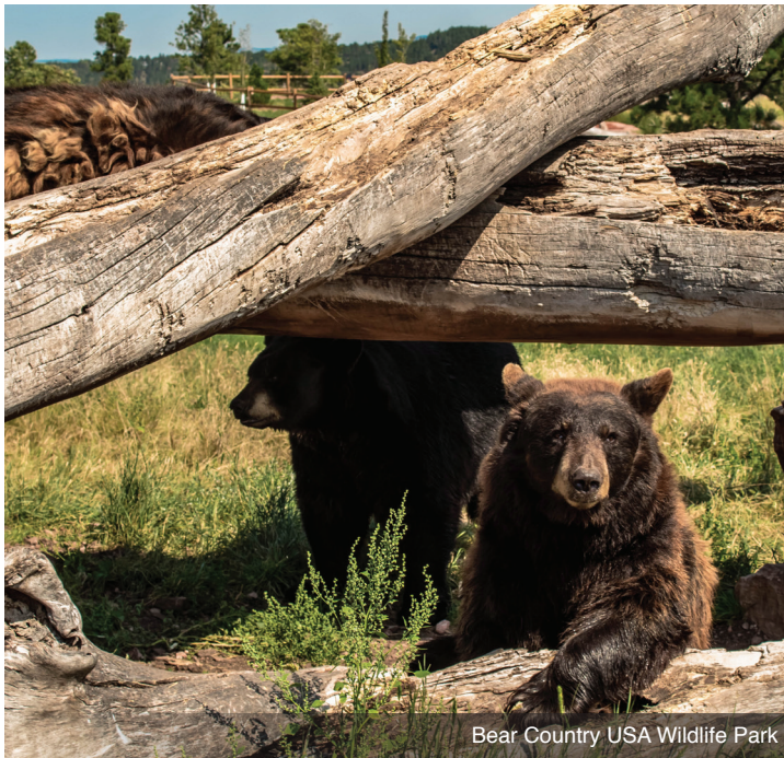
Bear Country USA Wildlife Park

an on own lunch. Then, a local guide takes you through Badlands National Park, a uniquely beautiful geologic area formed over millions of years by wind, rain and erosion. Return to Rapid City for a farewell dinner featuring the entertainment of an Indian dancer, storyteller and flute player. Meals: B, D