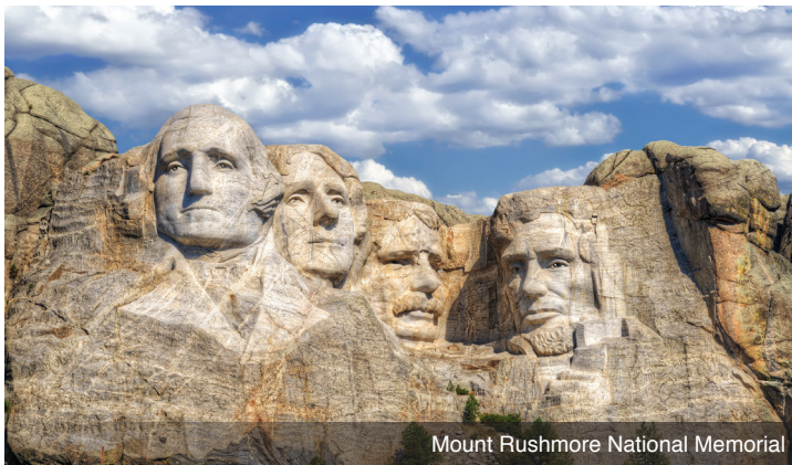
Mount Rushmore National Memorial

DAY 6 Travel Home: After breakfast, a group transfer to the Rapid City airport is available for flights out after 10:00 a.m. Meal: B