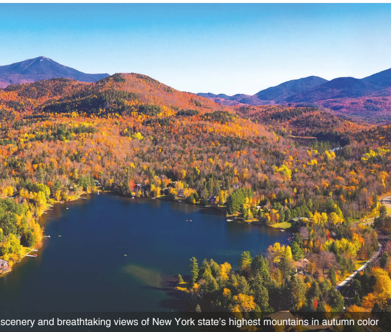
scenery and breathtaking views of New York state's highest mountains in autumn color