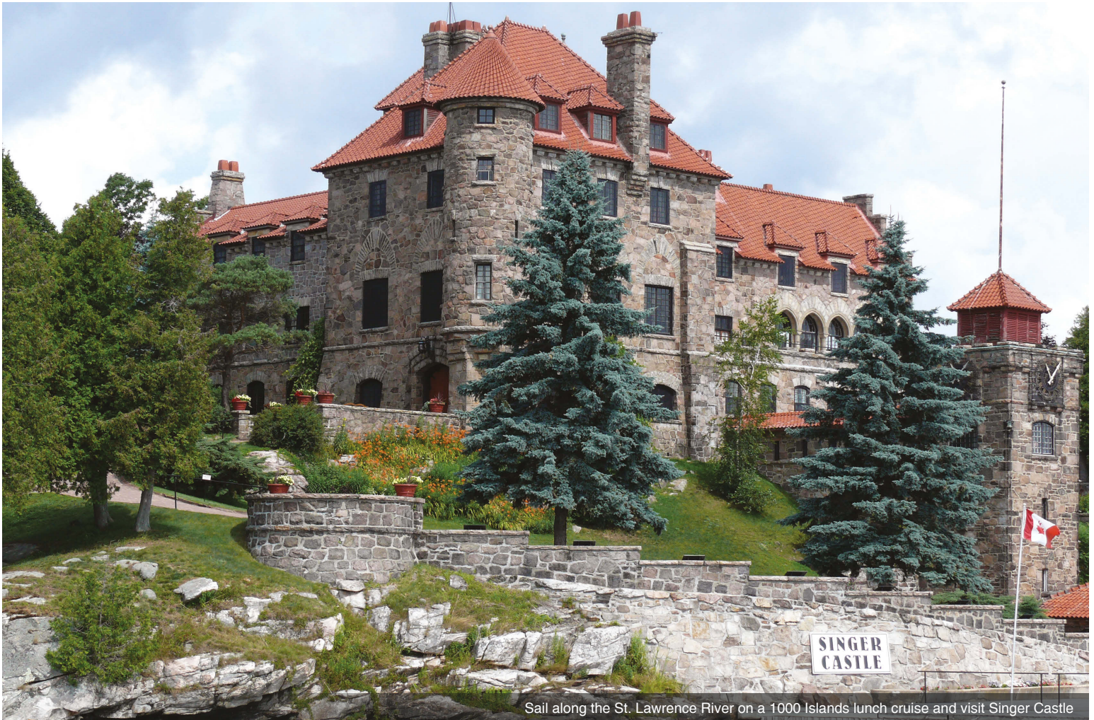
Sail along the St. Lawrence River on a 1000 Islands lunch cruise and visit Singer Castle