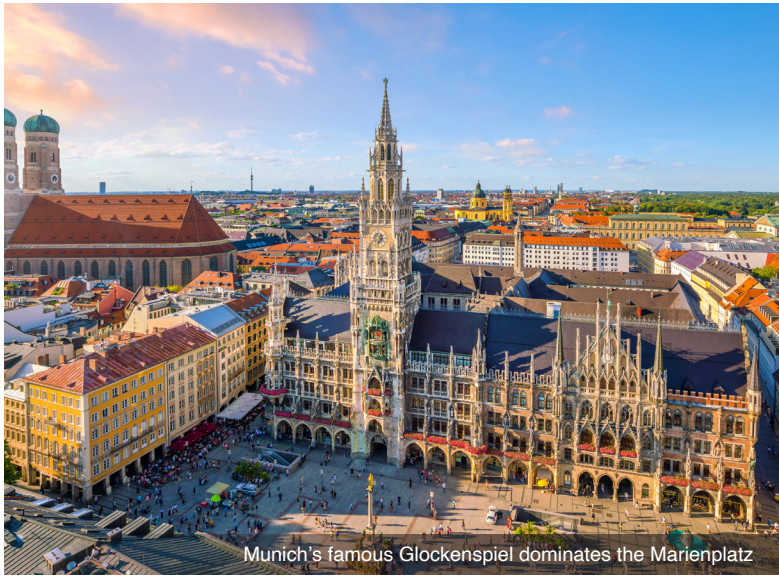
Munich's famous Glockenspiel dominates the Marienplatz

castle complex. During the excursion, visit the 15th-century St. Vitus' Church, a highlight of the town. Meals: B, D