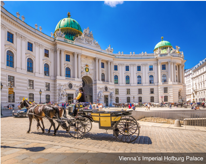
Vienna's Imperial Hofburg Palace