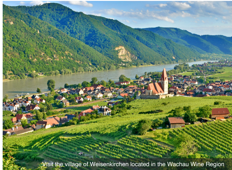
Visit the village of Weissenkirchen located in the Wachau Wine Region

DAY 1 Depart the USA: Depart the USA on your overnight flight to Budapest, Hungary.