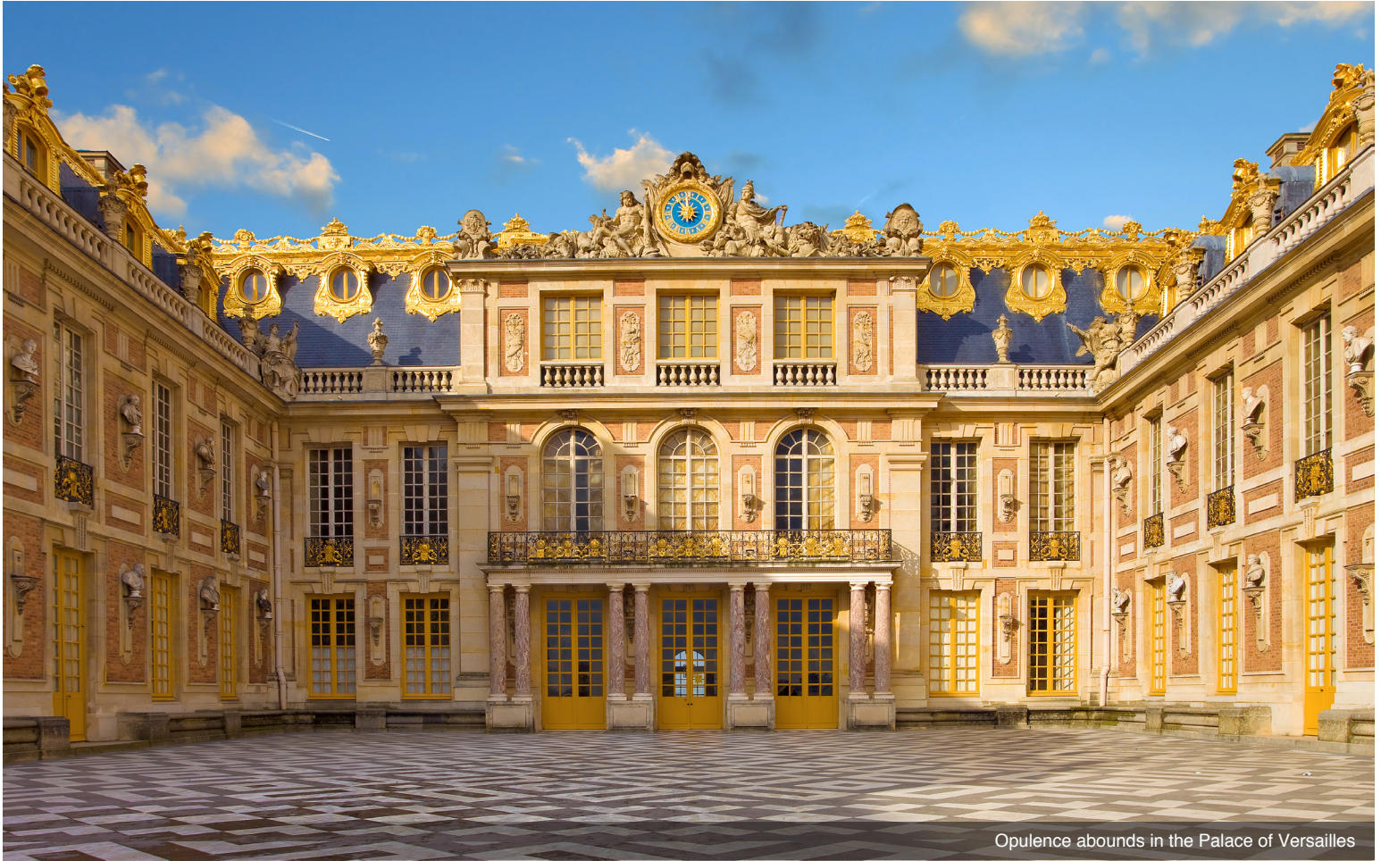
Opulence abounds in the Palace of Versailles