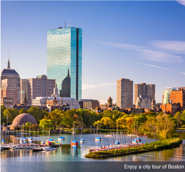
Enjoy a city tour of Boston