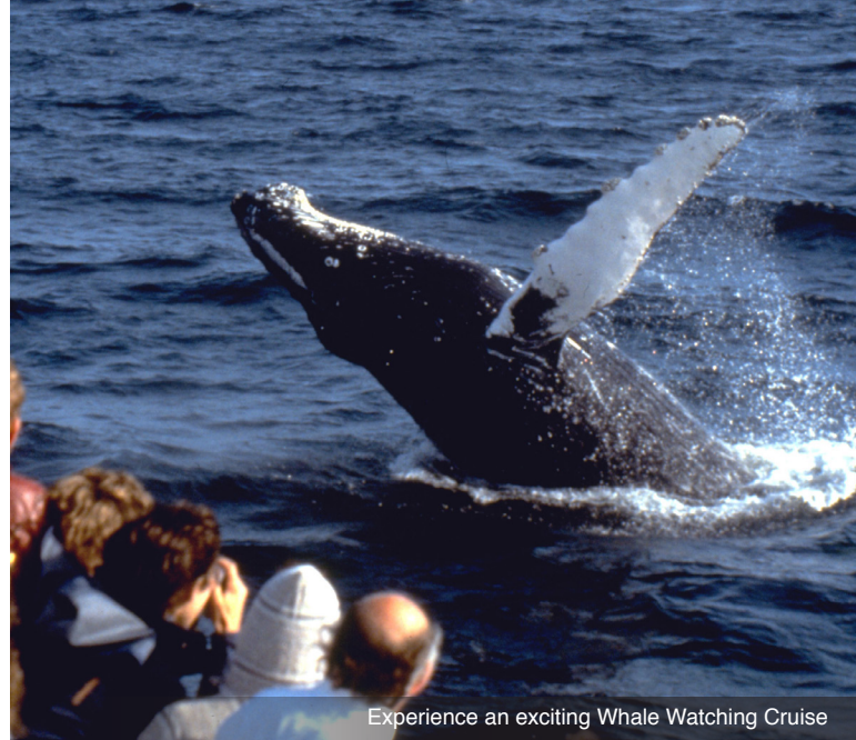
Experience an exciting Whale Watching Cruise