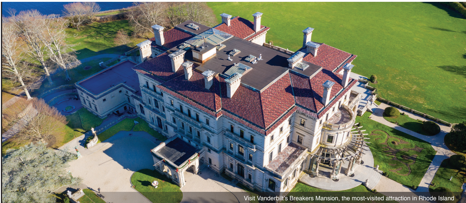
Visit Vanderbilt's Breakers Mansion, the most-visited attraction in Rhode Island

DAY 6 Newport Sightseeing and the Mansions: Entering the smallest New England state, arrive in Newport, Rhode Island. A local guide shows you this fascinating seaport. Famous not only for its maritime history and scenic ten-mile long Ocean Drive, Newport houses some fabulous summer homes built here during America's glamorous "Gilded Age." Visit Vanderbilt's Breakers Mansion and the impressive Marble House to get a glimpse of how America's most elite families lived at the turn of the century. Meals: B, L