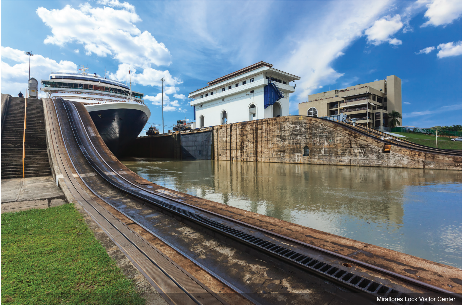
Miraflores Lock Visitor Center