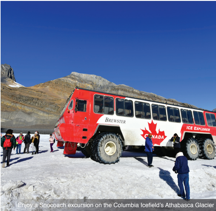
Enjoy a Snocoach excursion on the Columbia Icefield's Athabasca Glacier