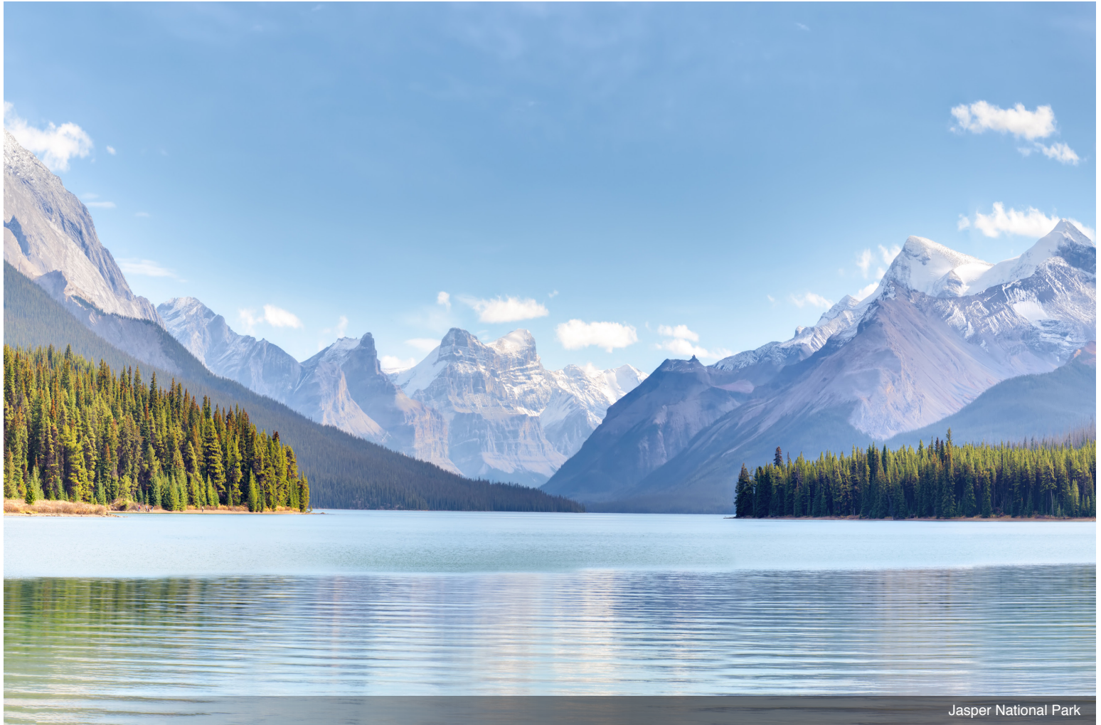
Jasper National Park