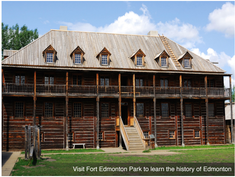
Visit Fort Edmonton Park to learn the history of Edmonton

DAY 9 Travel Home: Following breakfast, depart Calgary on a group transfer to the Calgary Airport for flights home. Meal: B