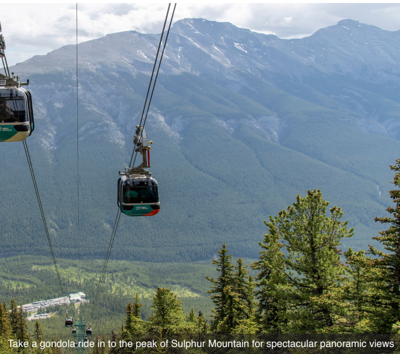
Take a gondola ride in to the peak of Sulphur Mountain for spectacular panoramic views

largest shopping center, the West Edmonton Mall. With over 800 stores, nine world-class attractions, two hotels and over 100 dining venue, the West Edmonton Mall has something for everyone. Meals: B, L