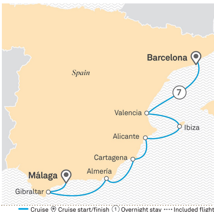
— Cruise 📍 Cruise start/finish ① Overnight stay ..... Included flight

Belle-Île-en-Mer is the largest island in the French region of Brittany. Small bays and beaches along the rocky coastline are sometimes only accessible from the sea. The capital, Le Palais, has an imposing citadel and plenty of cafés along the harbour and in the Place de la République. While living here, Monet produced 39 paintings of the wild Côte Sauvage.