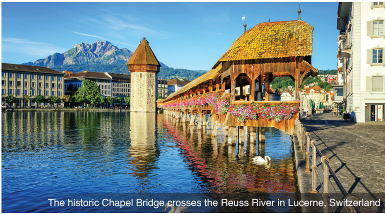
The historic Chapel Bridge crosses the Reuss River in Lucerne, Switzerland

DAY 8 Breisach, Germany: Experience the 'tale of two cities': Breisach, Germany and Neuf-Breisach, France, divided by the Rhine. During the guided visit to these two wonderful gems on the Rhine River, you'll pass the main sights and attractions, including the UNESCO World Heritage fortress overlooking Neuf-Breisach. Meals: B, L, D