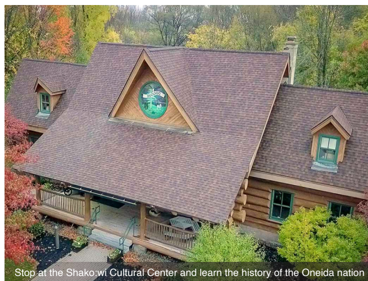
Stop at the Shako:wi Cultural Center and learn the history of the Oneida nation

DAY 8 Return Home: This morning a group transfer to the Syracuse Hancock International Airport for flights out after 12:00 p.m. Meal: B