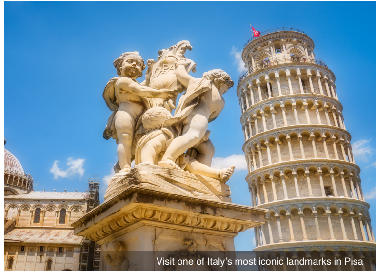
Visit one of Italy's most iconic landmarks in Pisa

DAY 1 Depart the USA: Depart the USA on your overnight flight to Florence, Italy.