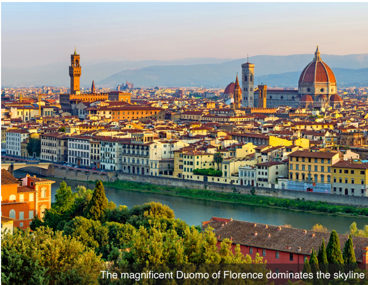
The magnificent Duomo of Florence dominates the skyline