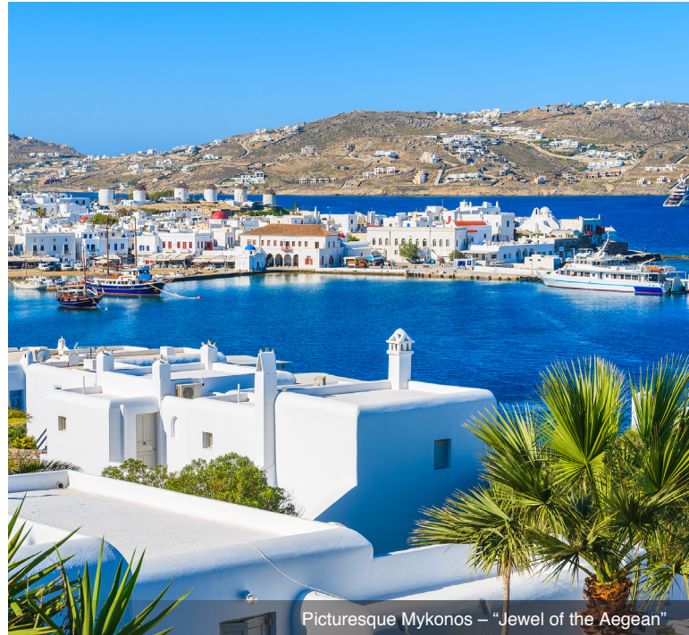
Picturesque Mykonos – “Jewel of the Aegean”

DAY 1 OCTOBER 18 Depart the USA: Depart the USA on your overnight flight to Athens, Greece, a city with a history that dates back almost four millennia.