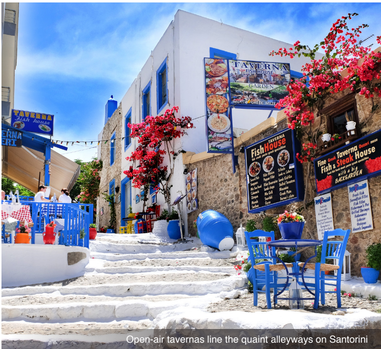
Open-air tavernas line the quaint alleyways on Santorini

at leisure. Browse in the boutiques, visit the beach or simply enjoy people-watching and meeting the locals at a sidewalk café. Meal: B