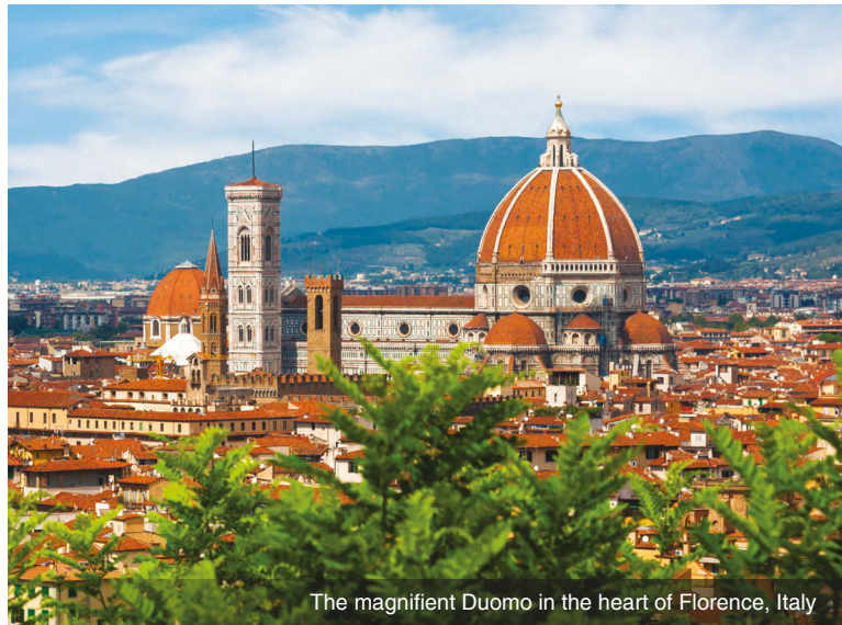
The magnificent Duomo in the heart of Florence, Italy

DAY 1 Depart the USA: Depart the USA on your overnight flight to Venice, Italy.