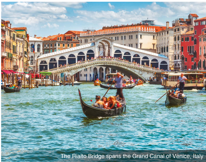
The Rialto Bridge spans the Grand Canal of Venice, Italy