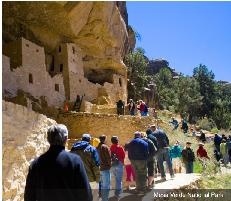
Mesa Verde National Park