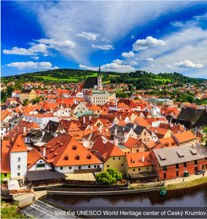
Visit the UNESCO World Heritage center of Český Krumlov