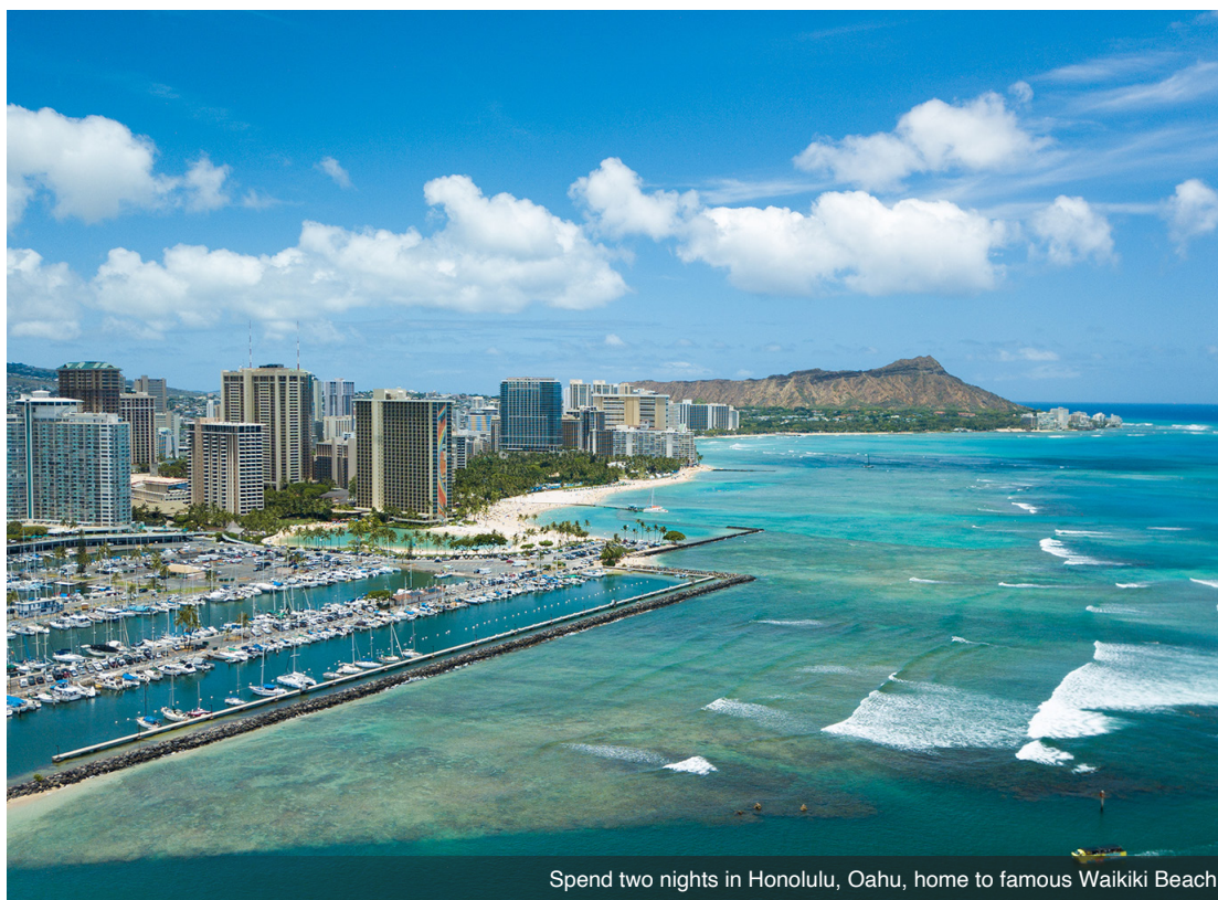
Spend two nights in Honolulu, Oahu, home to famous Waikiki Beach