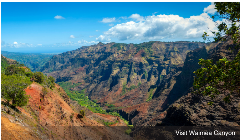
Visit Waimea Canyon

Rooms for the night before the tour are available. Cost for a room in Honolulu is $599, tax and breakfast included.