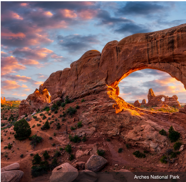
Arches National Park

conducts a narrated tour. Tonight, your Tour Manager hosts a farewell dinner. Meals: B, D