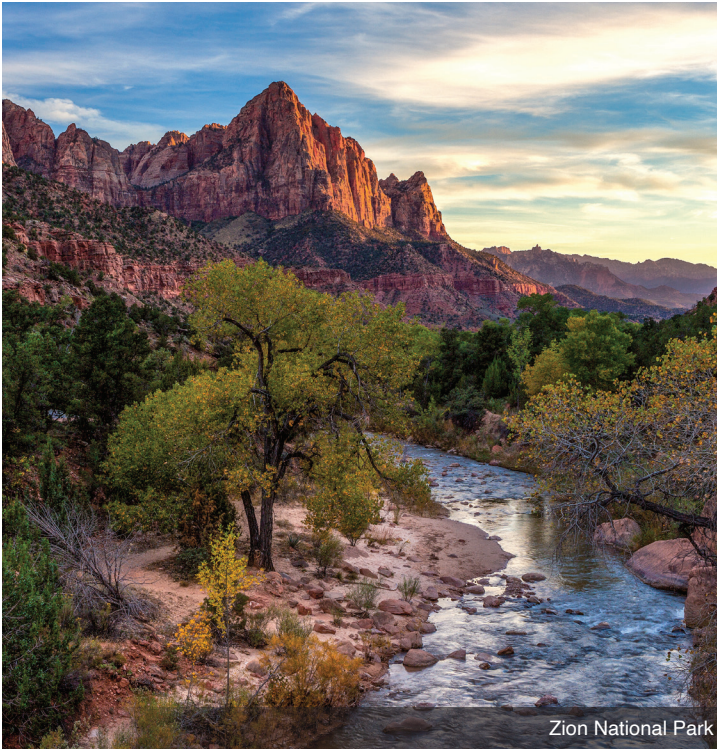
Zion National Park