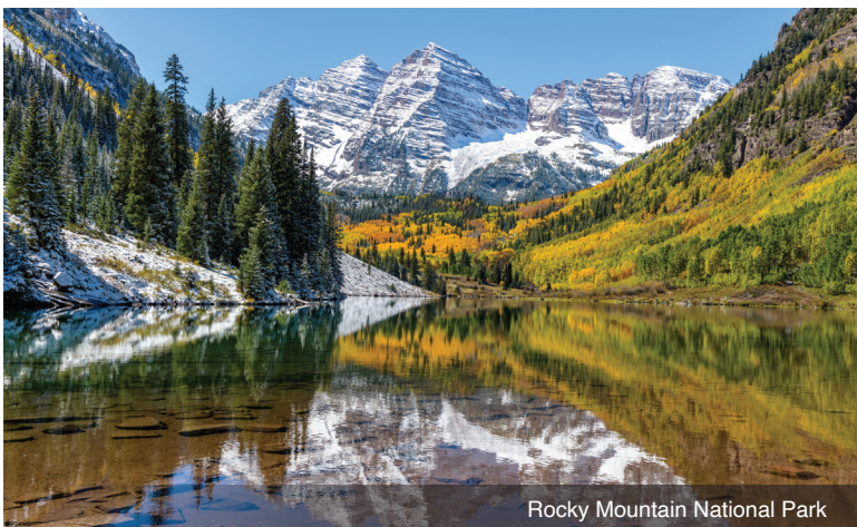
Rocky Mountain National Park

Room for the nights before and after the tour are available. Cost for a room in Las Vegas is $279, and in Denver is $459, tax and breakfast included.