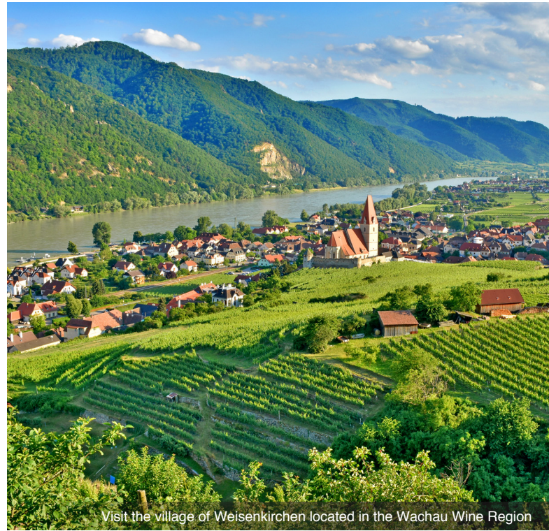
Visit the village of Weissenkirchen located in the Wachau Wine Region

DAY 1 USA / Munich, Germany: Depart the USA on your overnight flight to Munich, Germany.