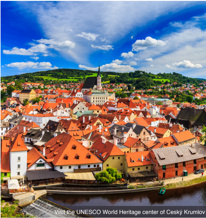
Visit the UNESCO World Heritage center of Český Krumlov