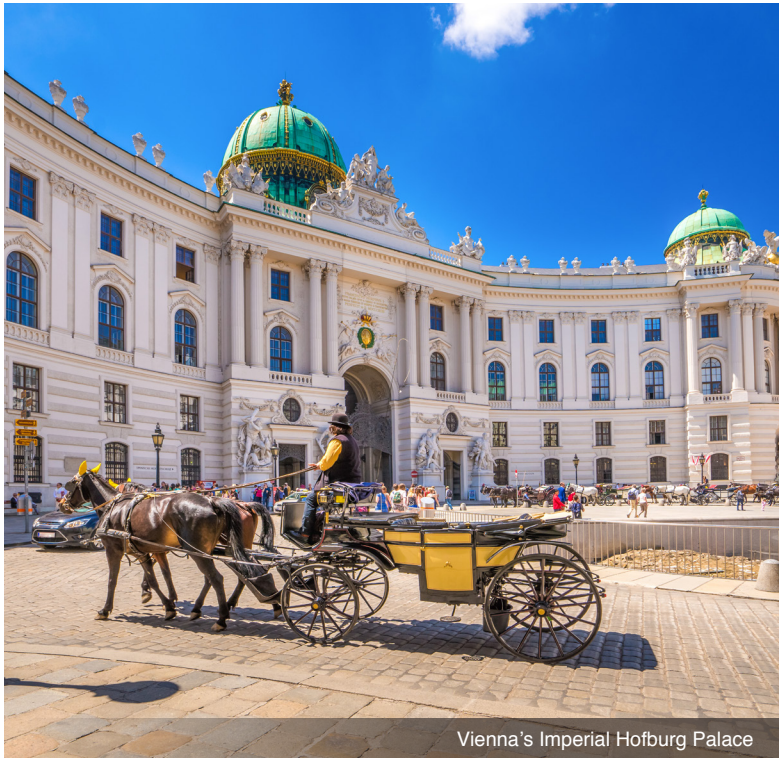
Vienna's Imperial Hofburg Palace

DAY 8 Budapest, Hungary: This morning, relax onboard your Star-Ship while sailing from Slovakia to Hungary. In Budapest, an exciting program awaits. As you sail into this magnificent city, it becomes immediately apparent why the Hungarian capital is known as the 'Pearl of the Danube'. Venture into the city independently or make use of our onboard bikes to explore Budapest's hidden treasures. Meals: B, L, D