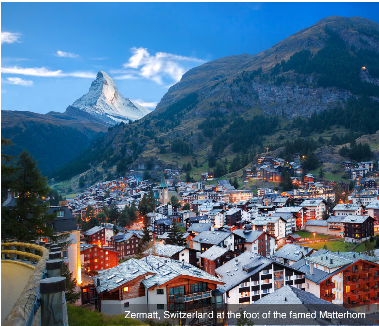
Zermatt, Switzerland at the foot of the famed Matterhorn

DAY 7 Zermatt: Today's highlight is the ascent to the Matterhorn Glacier Paradise, the highest cable car station of the Alps. Ascend via cable car to a height of 12,740 feet above sea level for spectacular views of the Matterhorn, the world's most photographed mountain and symbol of Switzerland. From the viewing platform at the summit, fresh mountain air and awe-inspiring views across the Swiss Alps await! Return to the base of the mountain via cable car and relax in town for the remainder of the day. Meal: B