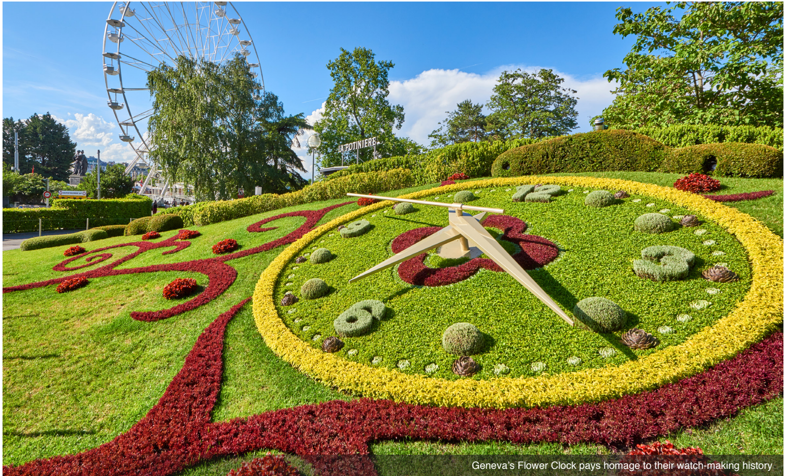
Geneva's Flower Clock pays homage to their watch-making history