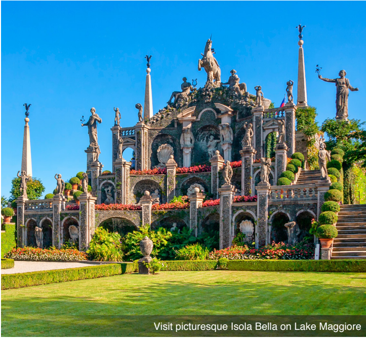
Visit picturesque Isola Bella on Lake Maggiore