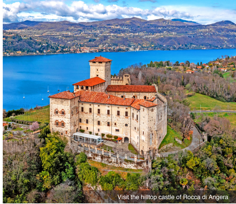
Visit the hilltop castle of Rocca di Angera

DAY 1 Depart the USA: Depart the USA on an overnight flight to Milan, Italy.