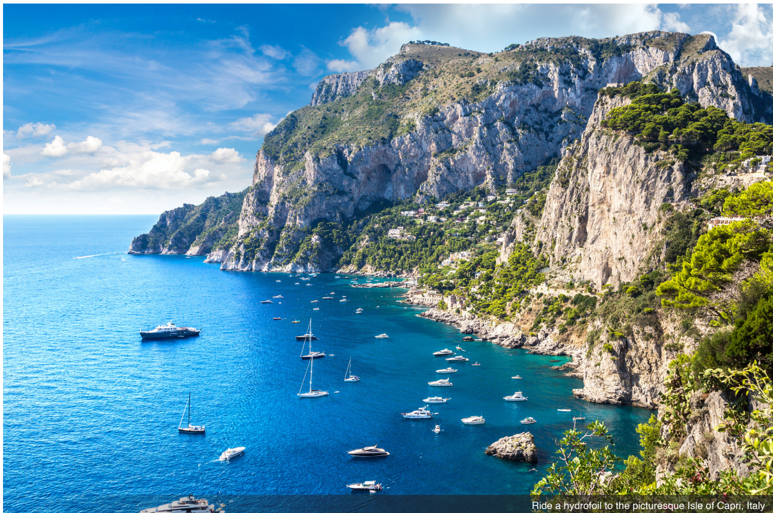
Ride a hydrofoil to the picturesque Isle of Capri, Italy