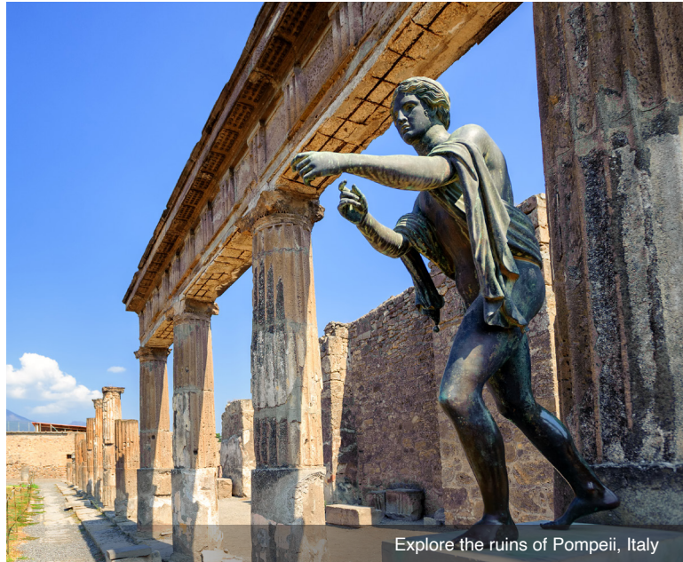
Explore the ruins of Pompeii, Italy

DAY 1 Depart the USA: Depart the USA on your overnight flight to Naples, Italy.