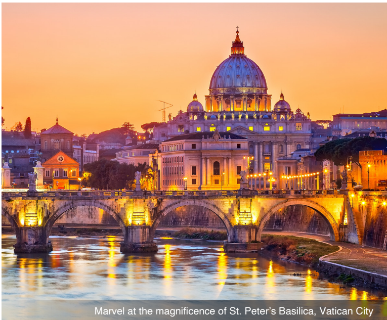
Marvel at the magnificence of St. Peter's Basilica, Vatican City

dating back to the first kings of Rome. After a morning of historic discovery, enjoy an afternoon and evening at leisure.