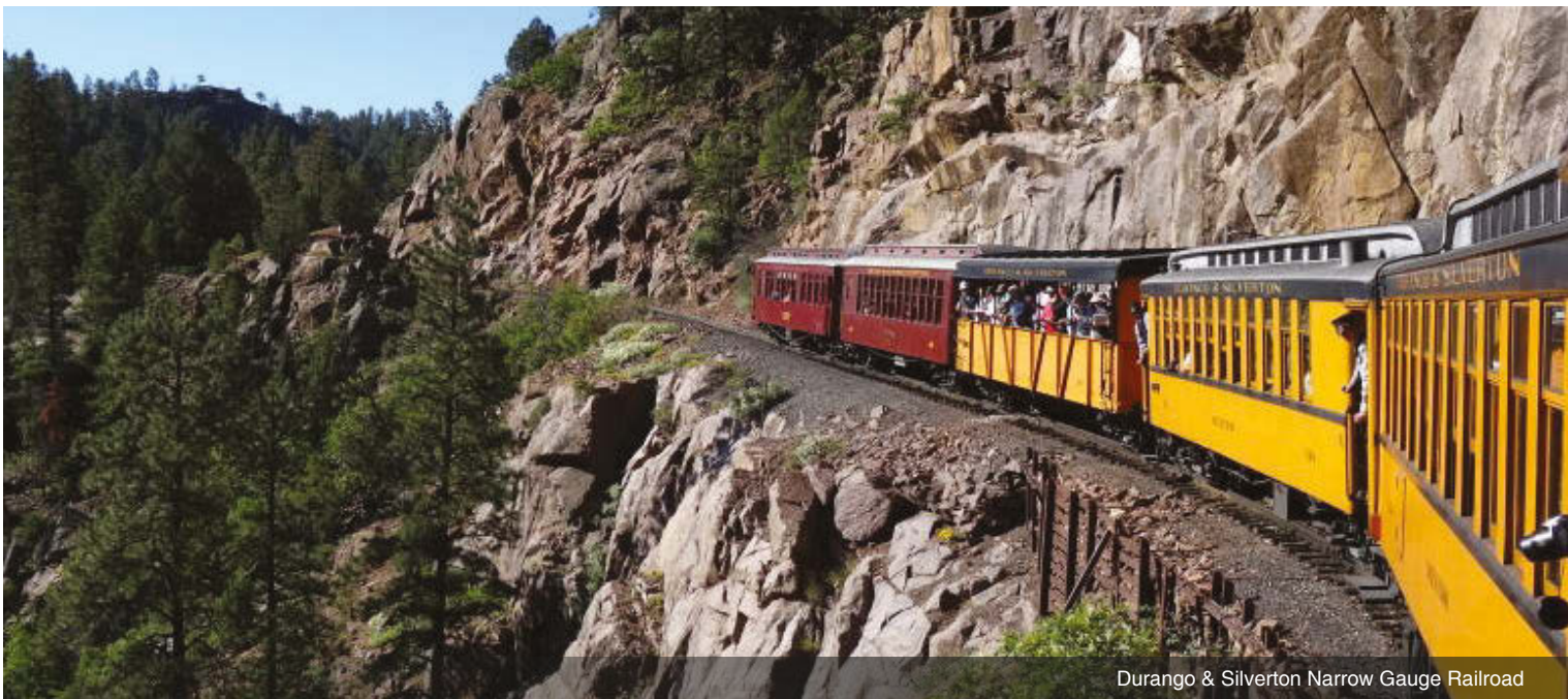
Durango & Silverton Narrow Gauge Railroad

DAY 6 Cumbres & Toltec Scenic Railroad: Your day begins as you board the motorcoach and ride to the Cumbres & Toltec Scenic Railroad, the original Rio Grande Line. This is America's most spectacular narrow gauge steam railroad. Explore 50 miles of wild and rugged territory between Chama, New Mexico and Antonito, Colorado, the highest point on the railroad. Meals: B, L