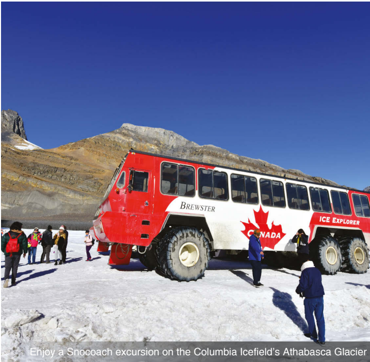
Enjoy a Snocoach excursion on the Columbia Icefield's Athabasca Glacier