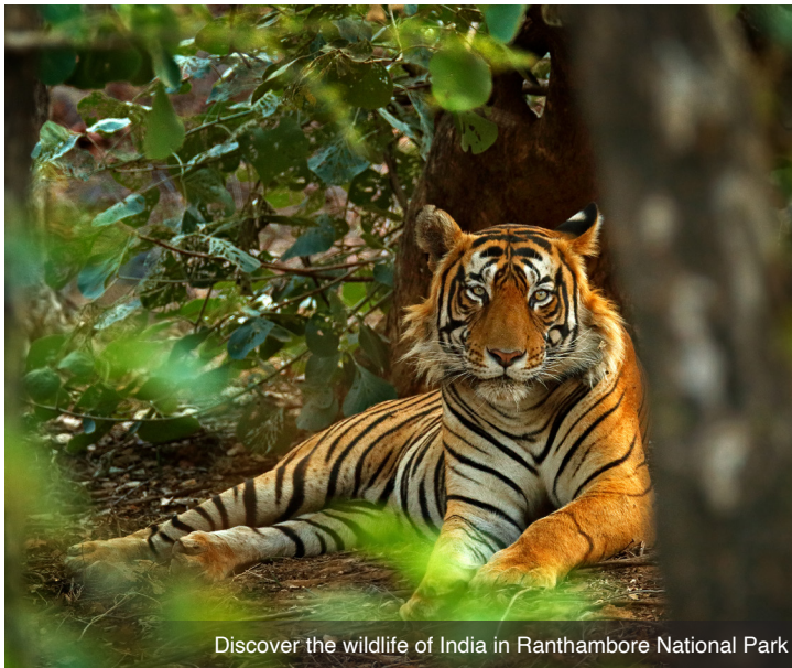
Discover the wildlife of India in Ranthambore National Park