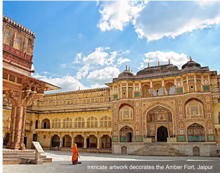
Intricate artwork decorates the Amber Fort, Jaipur

DAY 1 Depart the USA : Depart the USA on an overnight flight to New Delhi, India, a city that bridges two different worlds.