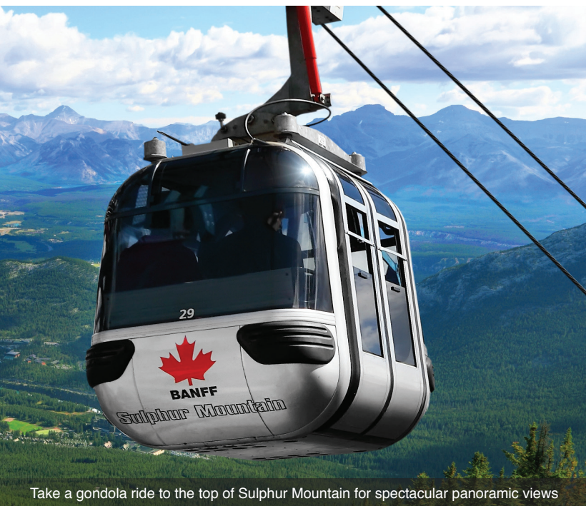
Take a gondola ride to the top of Sulphur Mountain for spectacular panoramic views

DAY 7 Museum of Anthropology, Granville Island and Gulf of Georgia Cannery: Begin the day at the Museum of Anthropology renowned for its world arts and cultures and works by the First Nation bands. Spend time at Granville Island's public market, the crown jewel of the island. This outdoor market features colourful food, produce stores, handcrafted products and unique gifts. Later visit the Gulf of Georgia Cannery. Built in 1894 this National Historic Site echoes the days of when British Columbia was a leading salmon producer. Meals: B, D