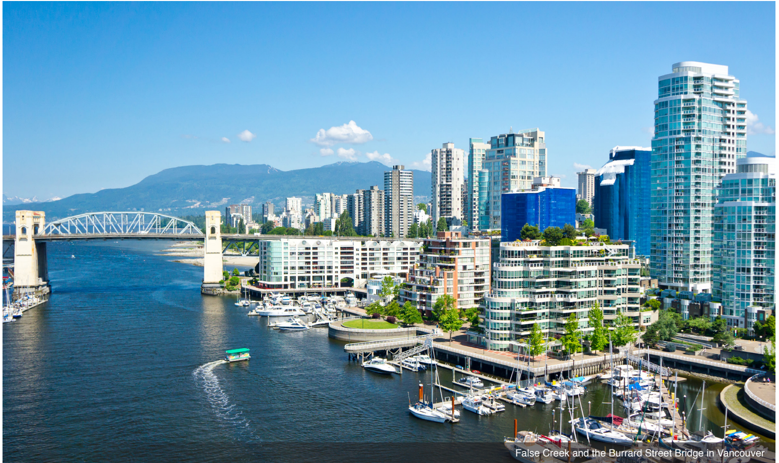
False Creek and the Burrard Street Bridge in Vancouver