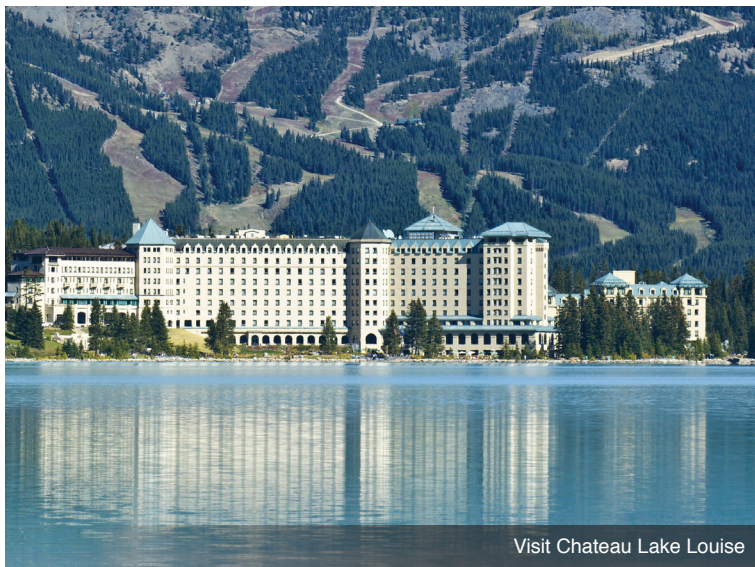
Visit Chateau Lake Louise

DAY 8 Return Home: Following breakfast, depart with a group transfer to the Vancouver International Airport for flights out after 11:00 a.m. Meal: B