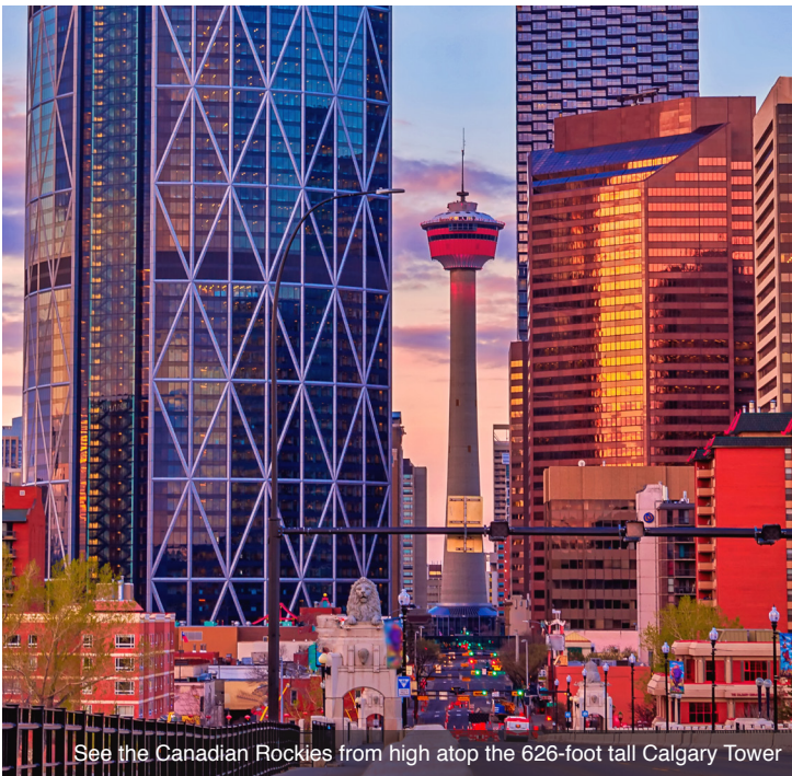
See the Canadian Rockies from high atop the 626-foot tall Calgary Tower