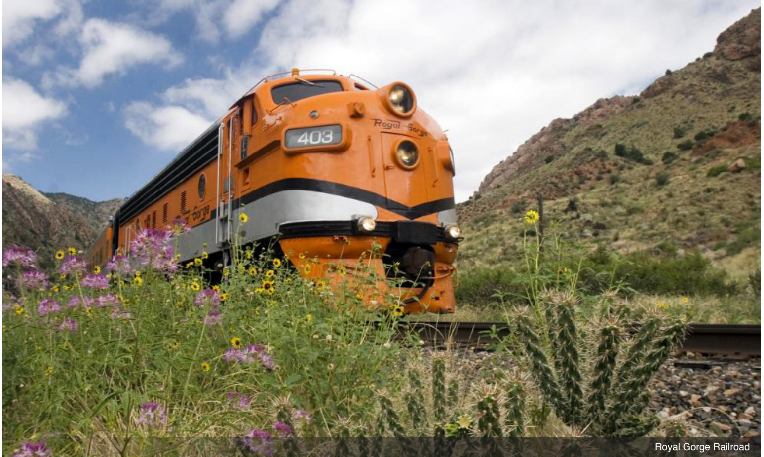
Royal Gorge Railroad