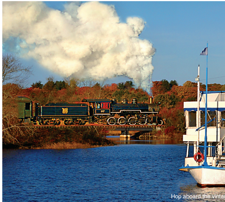
Hop aboard the vintage

DAY 1 Arrive in Boston: Arrive in Boston, Massachusetts with an included transfer to your hotel. Meet your Tour Manager in the hotel lobby at 6:00 p.m. for a welcome dinner. Meal: D