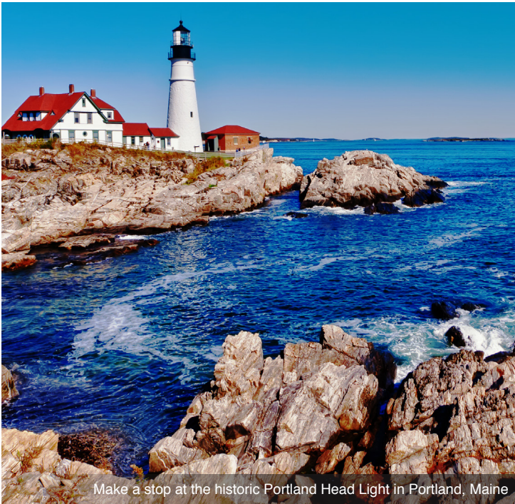
Make a stop at the historic Portland Head Light in Portland, Maine