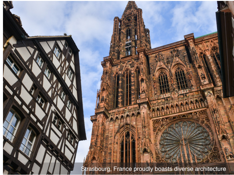
Strasbourg, France proudly boasts diverse architecture

DAY 1 Depart the USA: Depart the USA on your overnight flight to Zurich, Switzerland.