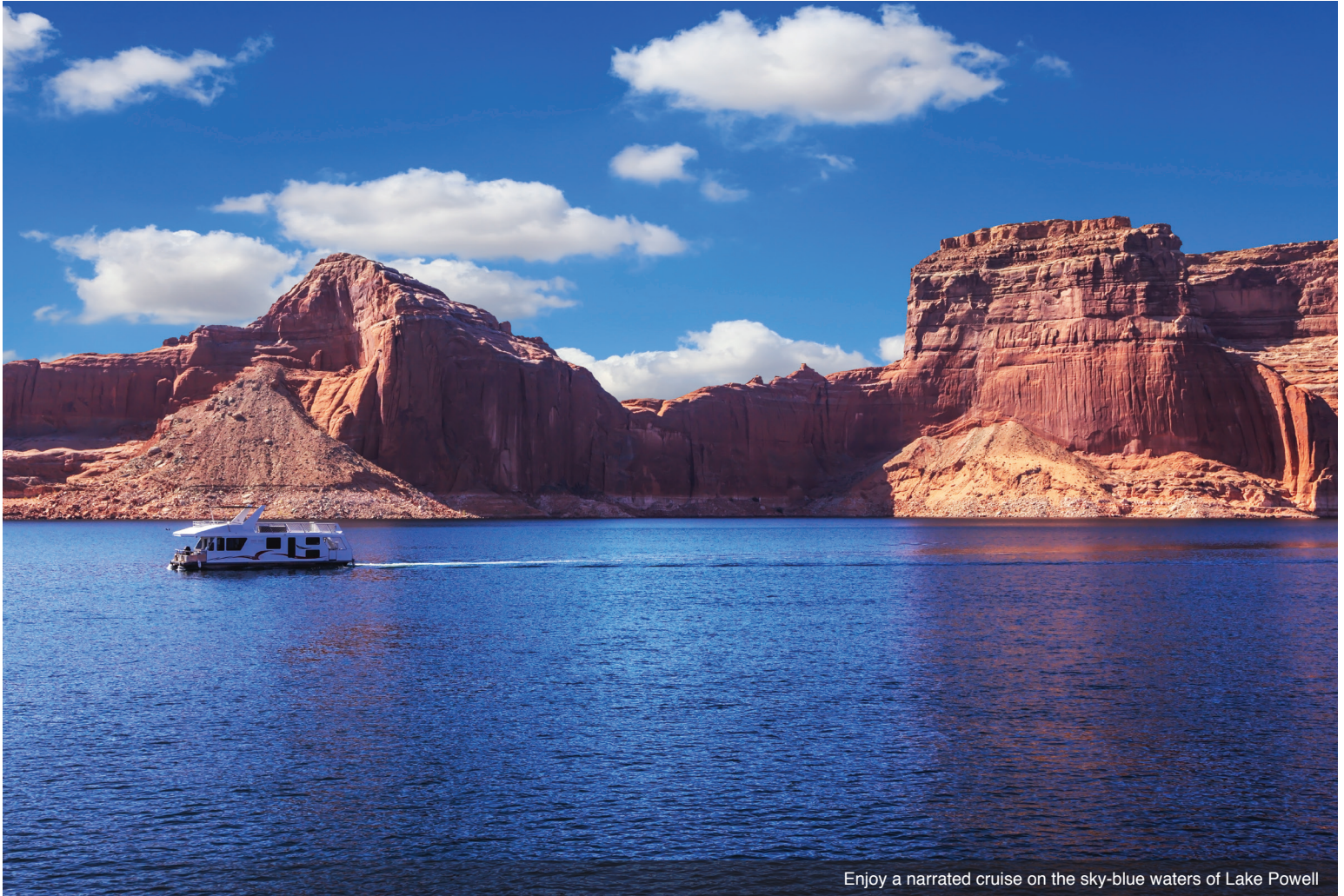
Enjoy a narrated cruise on the sky-blue waters of Lake Powell