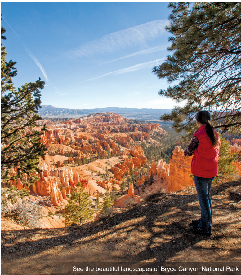
See the beautiful landscapes of Bryce Canyon National Park

Follow the Rim Drive to view the vividly-colored, fantastic rock formations approximating castles, temples and even whole cities sculptured in stone! Called hoodoos, these structures have been formed by frost weathering and stream erosion of the river and lake bed sedimentary rocks. Meals: B, D