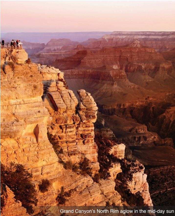
Grand Canyon's North Rim aglow in the mid-day sun