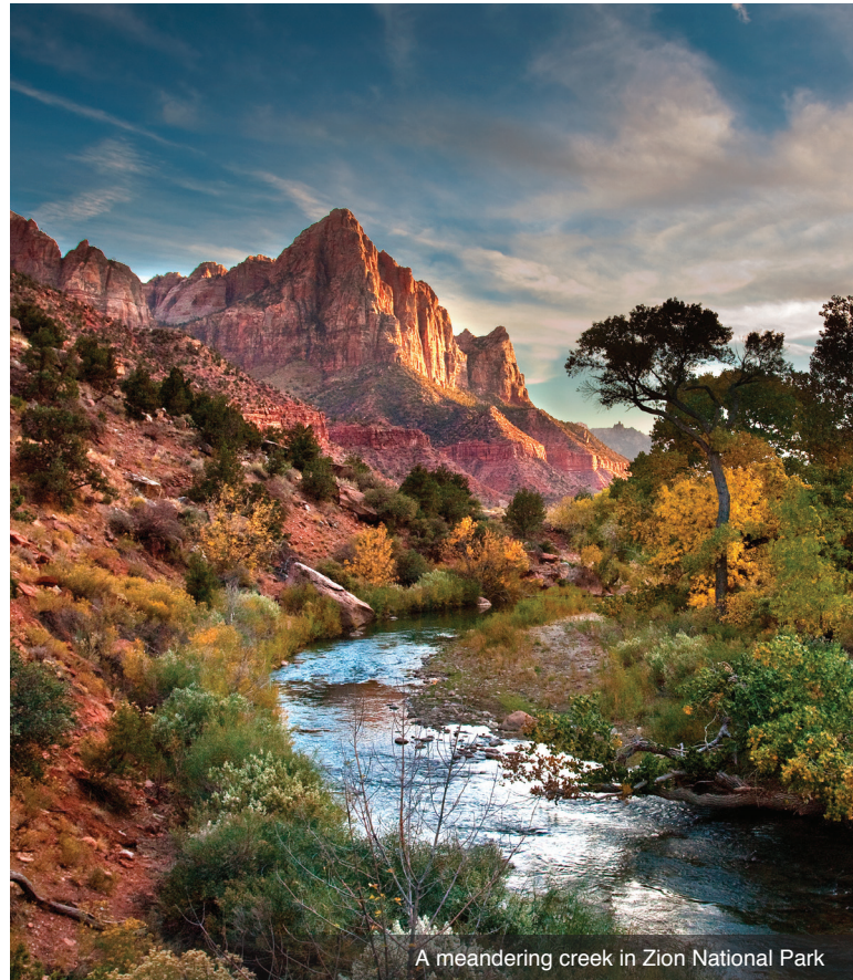
A meandering creek in Zion National Park

DAY 1 Arrive in Utah: Welcome to Salt Lake City, Utah. With flights arriving from across the country, meet your Tour Manager in the hotel lobby at 6:00 p.m. for dining suggestions.