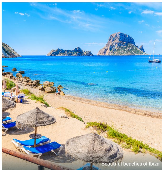
Beautiful beaches of Ibiza

The itinerary is a guide only and may be amended for operational reasons. As such Mayflower & Scenic cannot guarantee the tour will operate unaltered from the itinerary stated above. Please refer to our terms and conditions for further information.