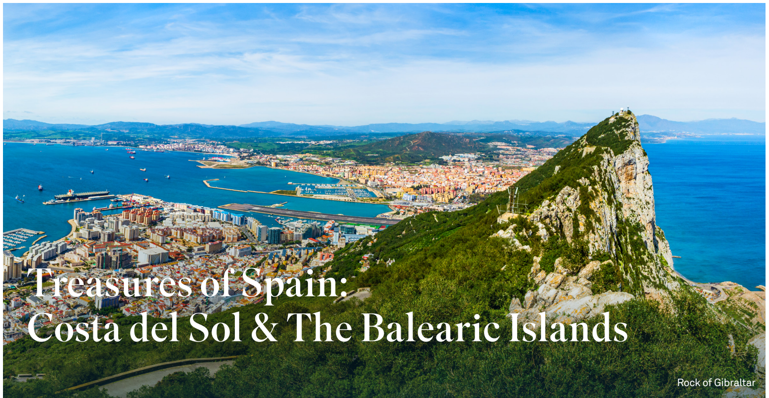
Rock of Gibraltar