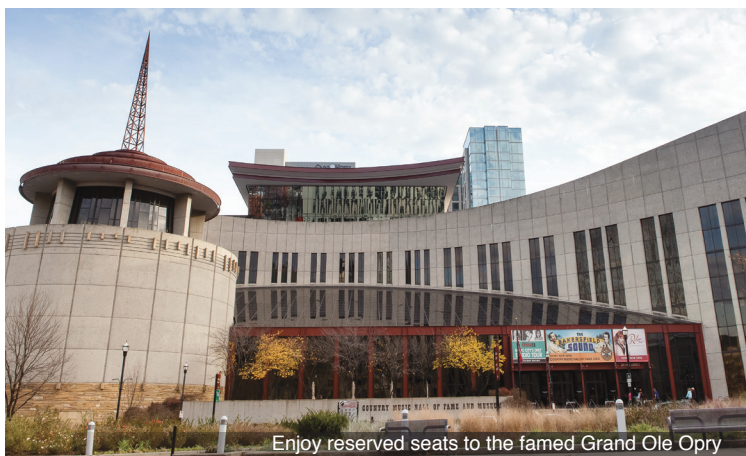
Enjoy reserved seats to the famed Grand Ole Opry

DAY 9 Return Home: After breakfast a group transfer takes you to the Nashville International Airport for flights home departing after 11:00 a.m. Meal: B