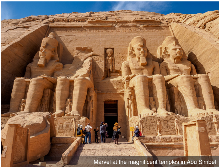
Marvel at the magnificent temples in Abu Simbel

DAY 7 OCTOBER 2 Edfu / Kom Ombo: After breakfast, visit the Temple of Horus in Edfu which is dedicated to Horus, the falcon-headed god. Not only is this the best preserved ancient temple in Egypt, but it is the second largest after Karnak. In the afternoon, sail to Kom Ombo, a pleasant agricultural town and home to many Nubians. Enjoy a cooking class onboard as you sail to the next port. Upon arrival, visit the unusual Temple of Kom Ombo dedicated to both Horus and the crocodile god Sobek. After re-embarking, the ship sails for Aswan. Relax on the Sun Deck as you cruise along the Nile. Meals: B, L, D