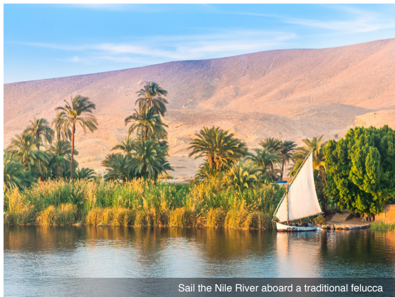
Sail the Nile River aboard a traditional felucca

DAY 1 SEPTEMBER 26 Depart the USA: Depart the USA on your transatlantic overnight flight to Cairo, Egypt.