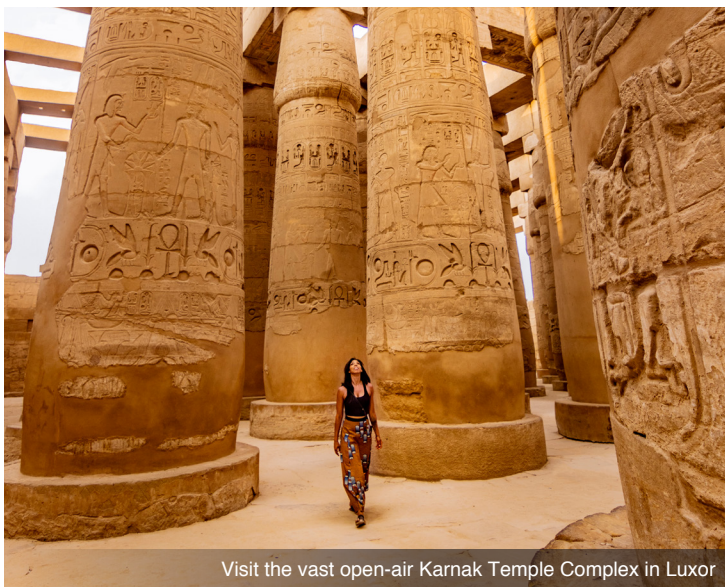
Visit the vast open-air Karnak Temple Complex in Luxor