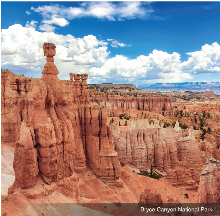
Bryce Canyon National Park

DAY 7 Homeward Bound: This morning a group transfer to Harry Reid International Airport is available for flights home departing after 12:00 p.m. Meal: B