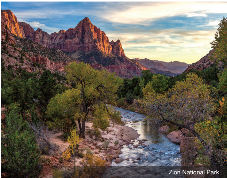
Zion National Park