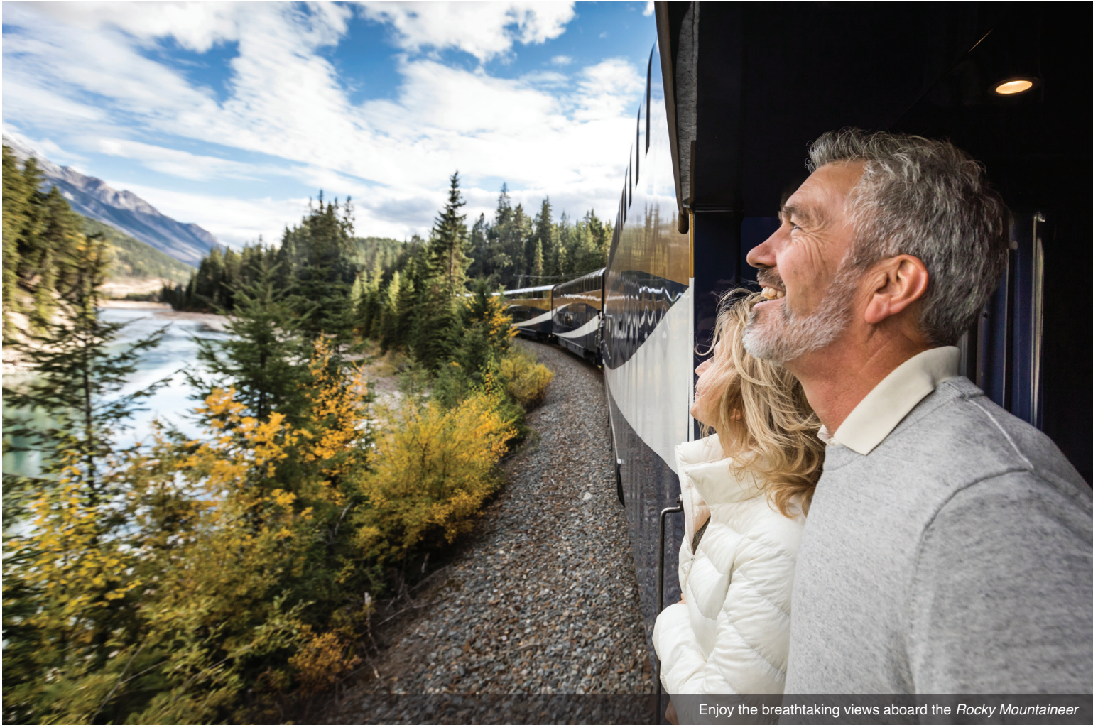
Enjoy the breathtaking views aboard the Rocky Mountaineer