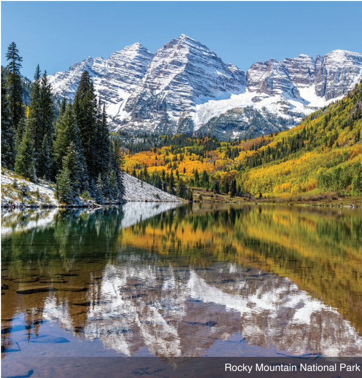
Rocky Mountain National Park