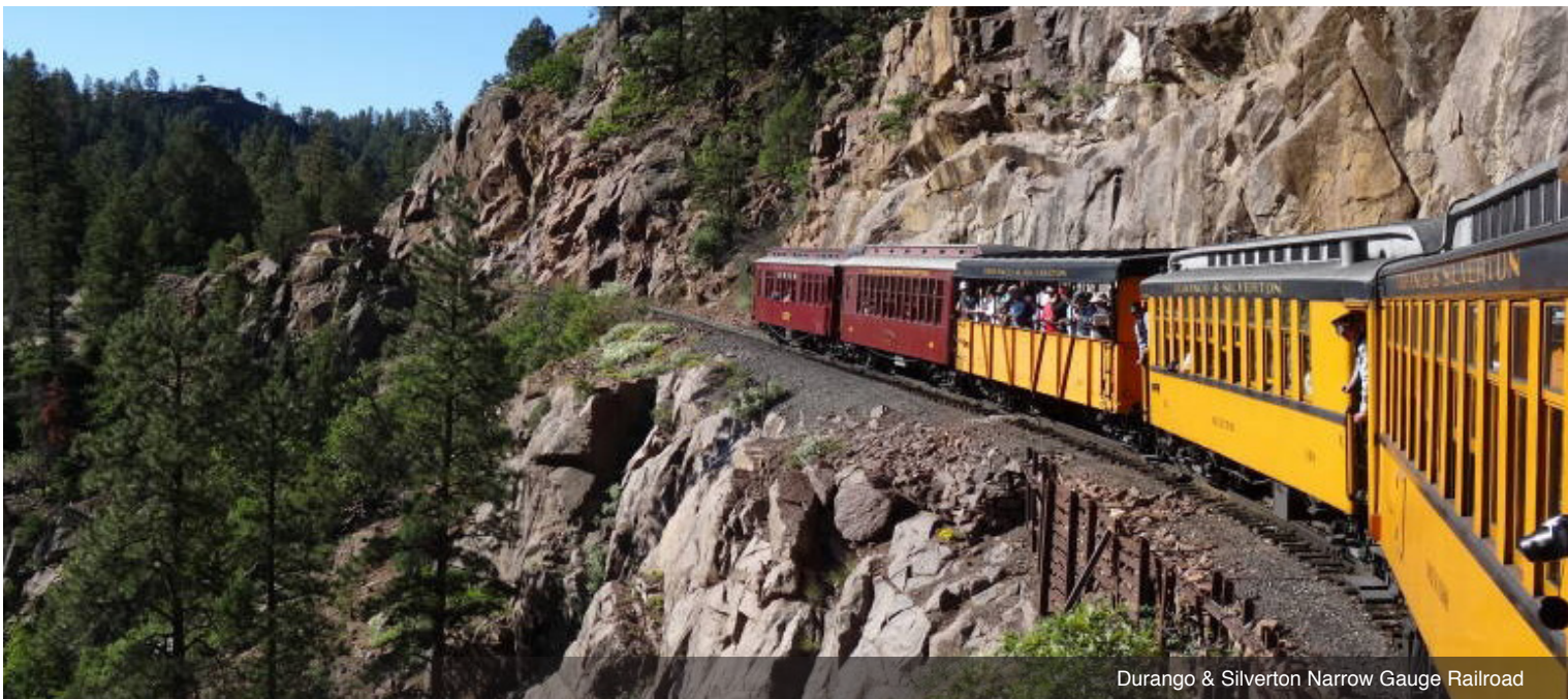
Durango & Silverton Narrow Gauge Railroad

DAY 6 Cumbres & Toltec Scenic Railroad: Your day begins as you board the motorcoach and ride to the Cumbres & Toltec Scenic Railroad, the original Rio Grande Line. This is America's most spectacular narrow gauge steam railroad. Explore 50 miles of wild and rugged territory between Chama, New Mexico and Antonito, Colorado, the highest point on the railroad. Meals: B, L