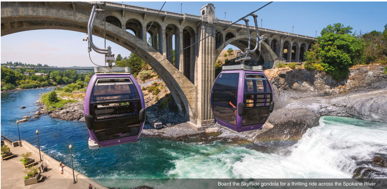
Board the SkyRide gondola for a thrilling ride across the Spokane River

the eagles and other raptors cared for by tribal wildlife staff under the direction of wildlife biologist Janie Veltkamp. Enjoy an included lunch and spend time shopping in the local native store. Then, return to the property with time to freshen up before the evening dinner cruise on Lake Coeur d'Alene.