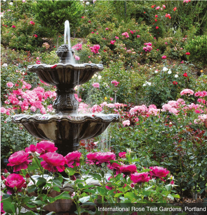
International Rose Test Gardens, Portland