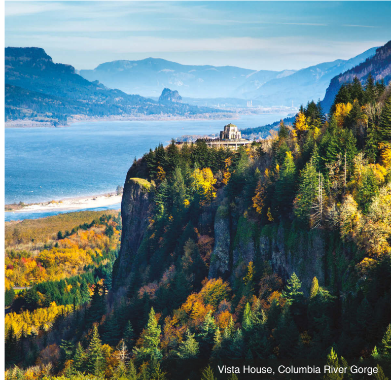
Vista House, Columbia River Gorge