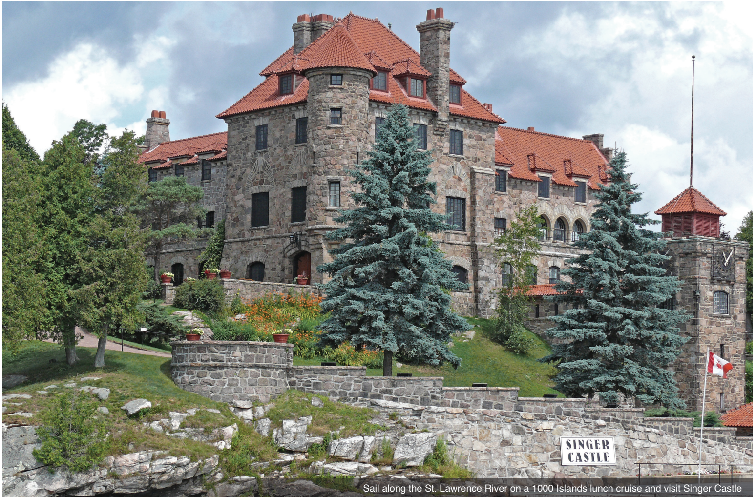
Sail along the St. Lawrence River on a 1000 Islands lunch cruise and visit Singer Castle