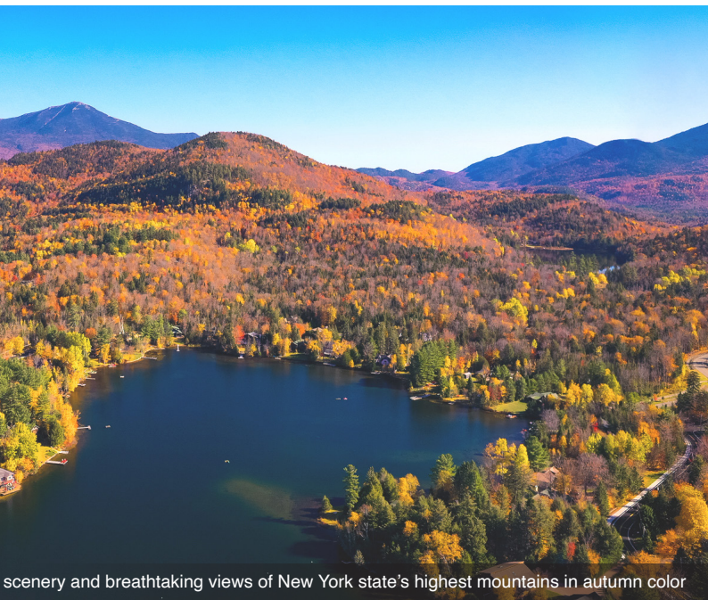
scenery and breathtaking views of New York state's highest mountains in autumn color