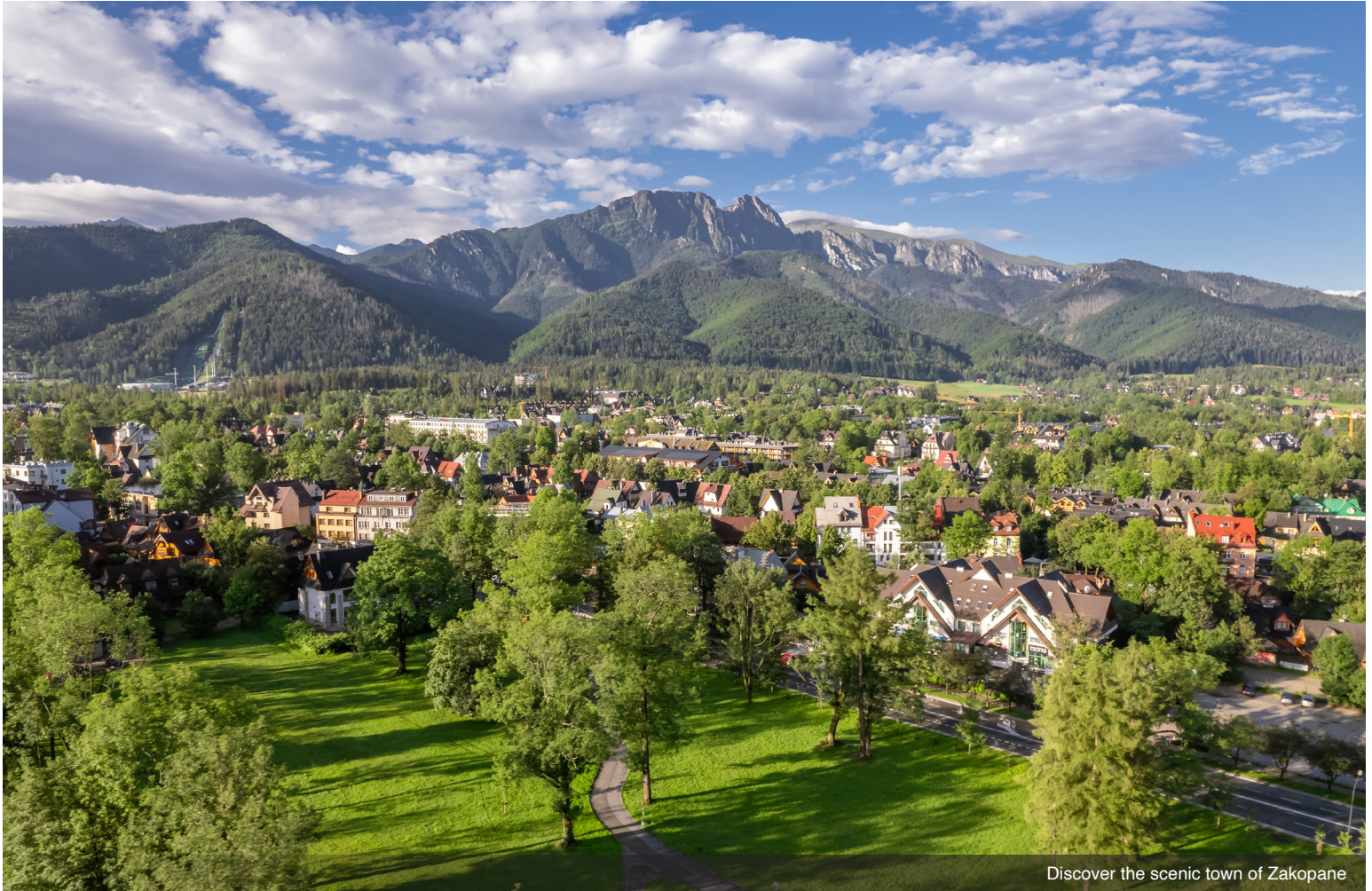
Discover the scenic town of Zakopane