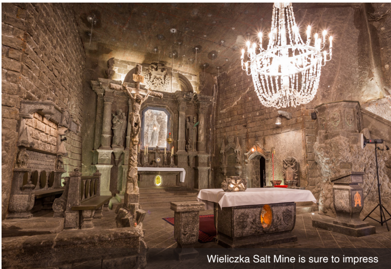
Wieliczka Salt Mine is sure to impress

famous attractions near Kraków. Walk through 20 chambers on three underground levels to explore the amazing grottoes of crystalline carvings, the subterranean lake with stunning colors and the Chapel of St. Kinga, an impressive “cathedral” with every feature carved out of solid salt. Meal: B