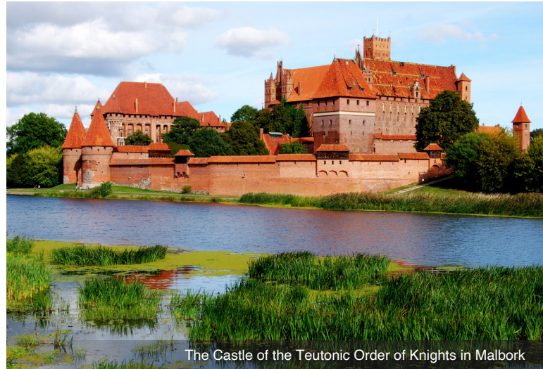
The Castle of the Teutonic Order of Knights in Malbork

DAY 1 Depart the USA: Depart the USA on your overnight flight to Gdansk, Poland.