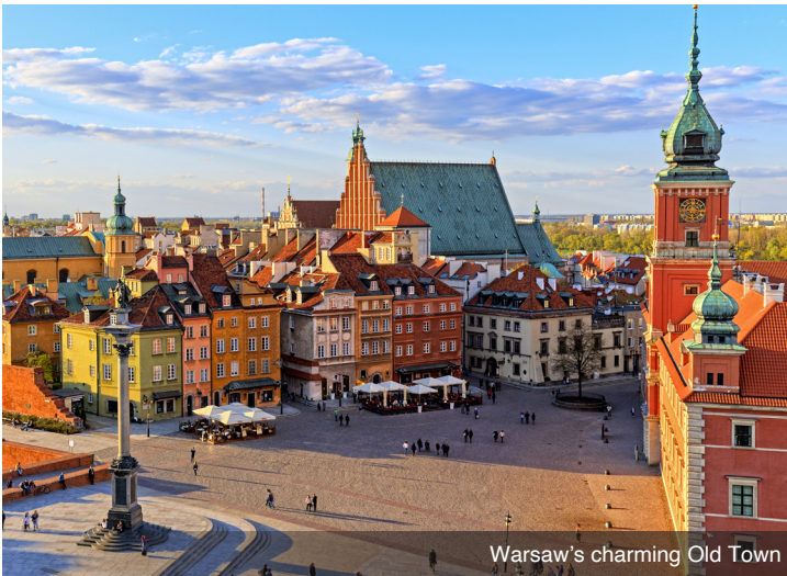
Warsaw's charming Old Town