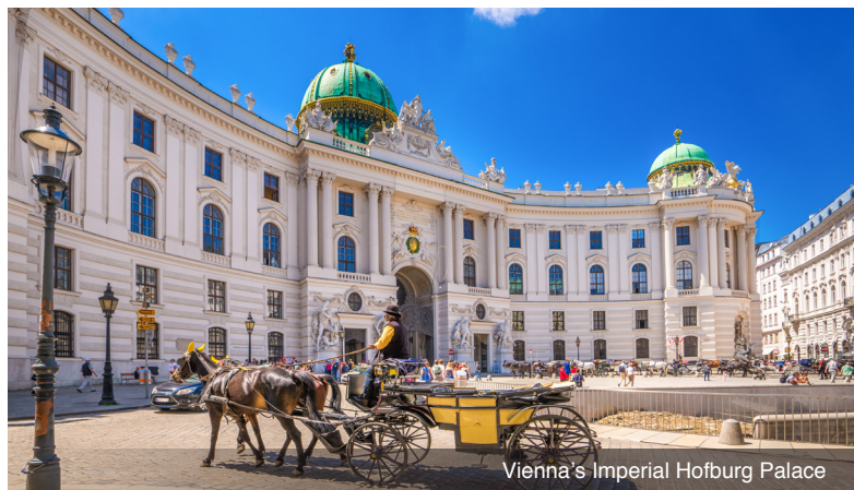
Vienna's Imperial Hofburg Palace

DAY 9 Bratislava, Slovakia: Today you sail into the capital of Slovakia. This graceful nation became an independent country in 1993, and since then, Bratislava has flourished as a new capital and made a name for itself as a cultural center. The romantic cobblestone lanes that weave through the city are explored with your local guide as you enjoy a walking tour of the ancient town center, seeing the Slovak National Theatre and a range of Gothic and Art Nouveau buildings. For the more active guests, embark on a guided hike to Bratislava Castle, a landmark steeped in legends that looks as though it came from the pages of a fairytale book. Meals: B, L, D EmeraldACTIVE: A guided hike to Bratislava Castle (instead of walking tour) DiscoverMORE: Skoda tour of post-Communist Bratislava (additional expense) EmeraldPLUS: Local Slovakian entertainment onboard