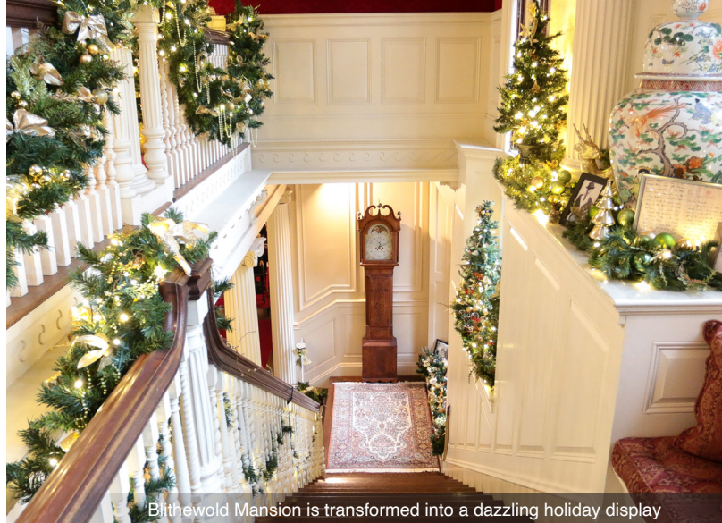
Blithewold Mansion is transformed into a dazzling holiday display

Air itineraries may not be available until documents are received. Air seats are assigned by the airline for the entire group. Seat changes can only be attempted upon receipt of tickets and documents at which time availability may be limited. If specific seat assignments are vital to your reservation, we recommend individual air reservations rather than booking air with the group.