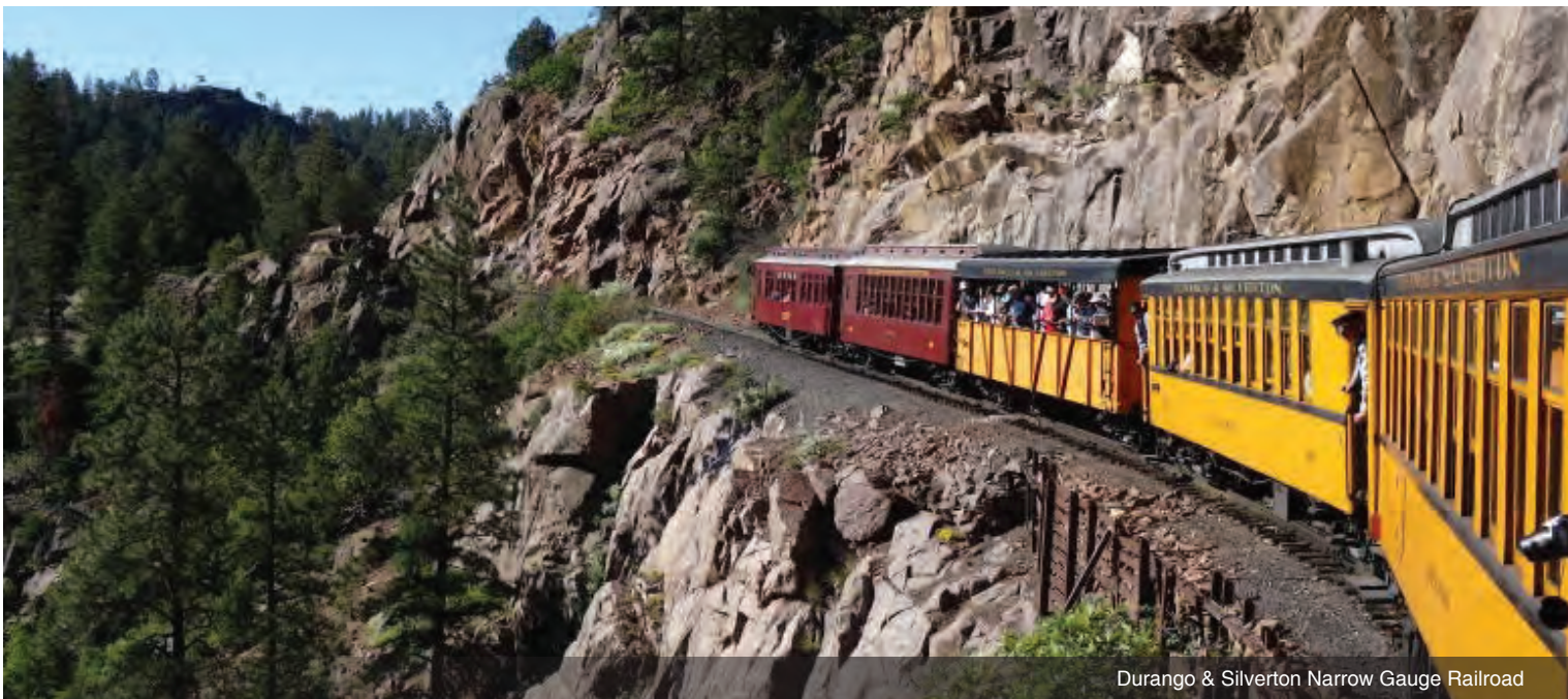
Durango & Silverton Narrow Gauge Railroad

DAY 6 Cumbres & Toltec Scenic Railroad: Your day begins as you board the motorcoach and ride to the Cumbres & Toltec Scenic Railroad, the original Rio Grande Line. This is America's most spectacular narrow gauge steam railroad. Explore 50 miles of wild and rugged territory between Chama, New Mexico and Antonito, Colorado, the highest point on the railroad. Meals: B, L