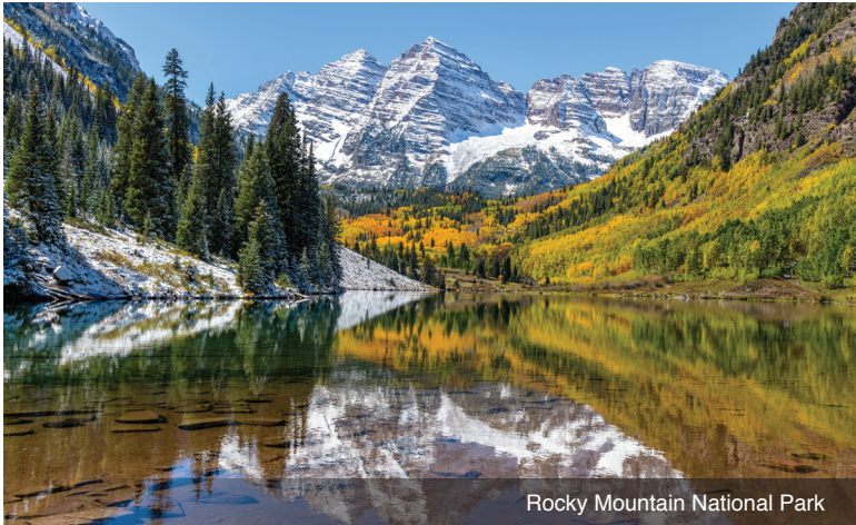
Rocky Mountain National Park

DAY 7 Homeward Bound: This morning a group transfer to the Denver International Airport is available for flights home departing after 12:00 p.m. Meal: B