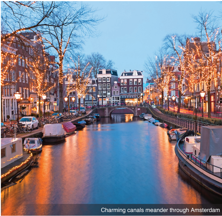
Charming canals meander through Amsterdam

glittering, festive, cottage-style stands and Lebkuchenherzen (traditional gingerbread hearts) to create a magical European Christmas experience. Meals: B, L, D