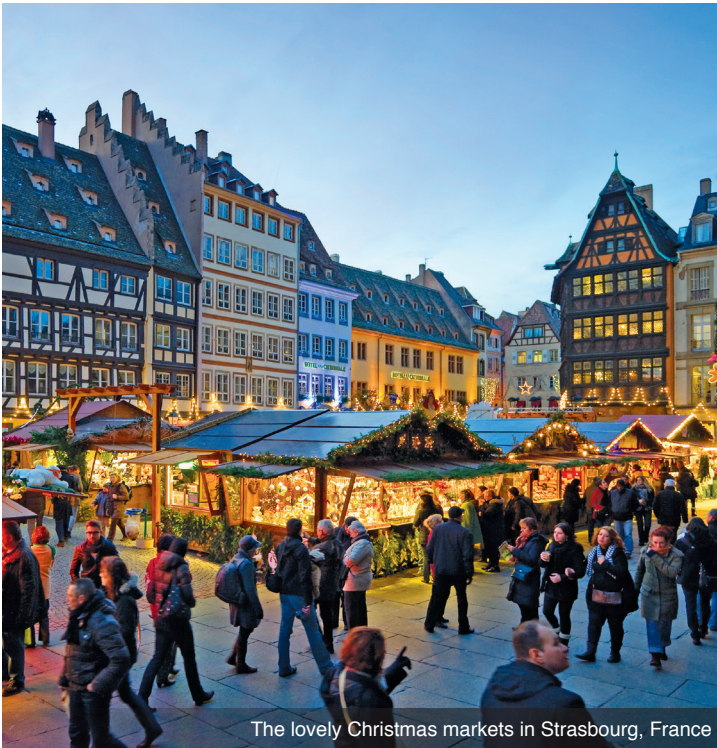
The lovely Christmas markets in Strasbourg, France