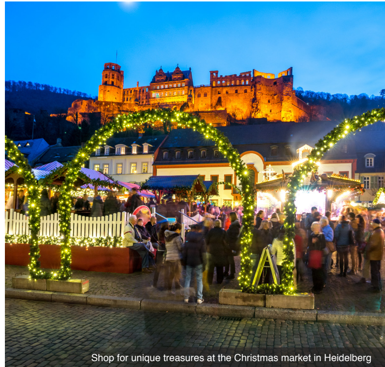
Shop for unique treasures at the Christmas market in Heidelberg

DAY 1 Depart the USA: Depart the USA on your overnight flight to Zurich, Switzerland.