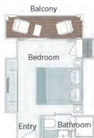
Grand Balcony Suite