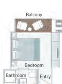
Panorama Balcony Suite