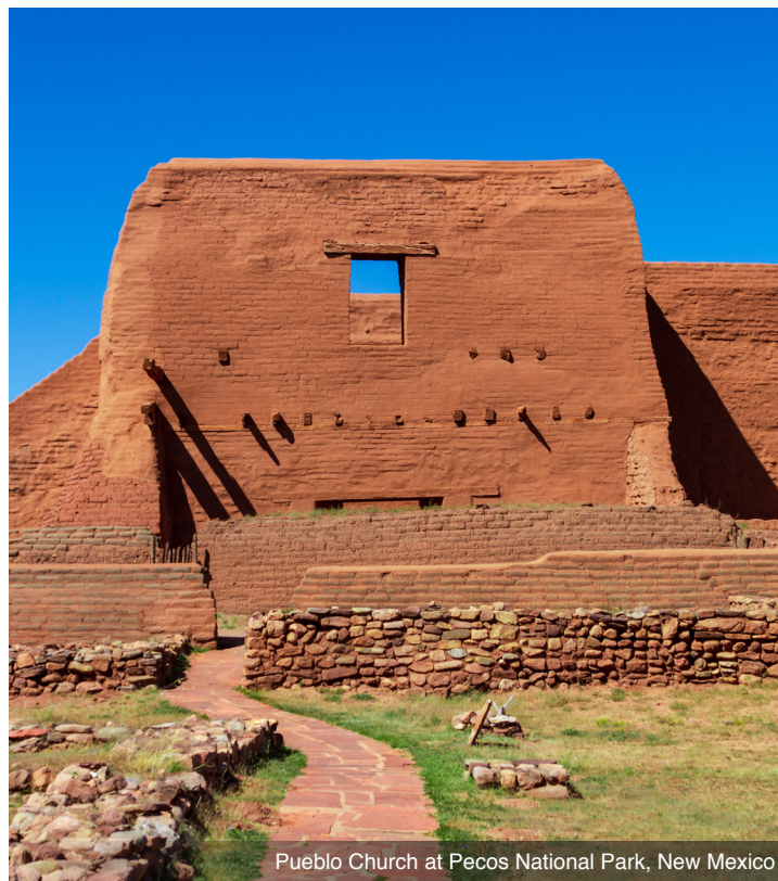
Pueblo Church at Pecos National Park, New Mexico

OCT 5 Albuquerque City Tour and Evening "Balloon Glow": Today, enjoy a city tour and explore the history of Albuquerque. There is free time today to explore Old Town. Get ready for a real treat this evening at the Balloon Glow event. Just before dusk, the burners of nearly 500 balloons are ignited and the