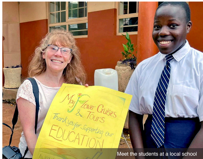
Meet the students at a local school

DAY 1 Depart USA: Depart the USA on your flight to the Republic of Uganda in Africa.