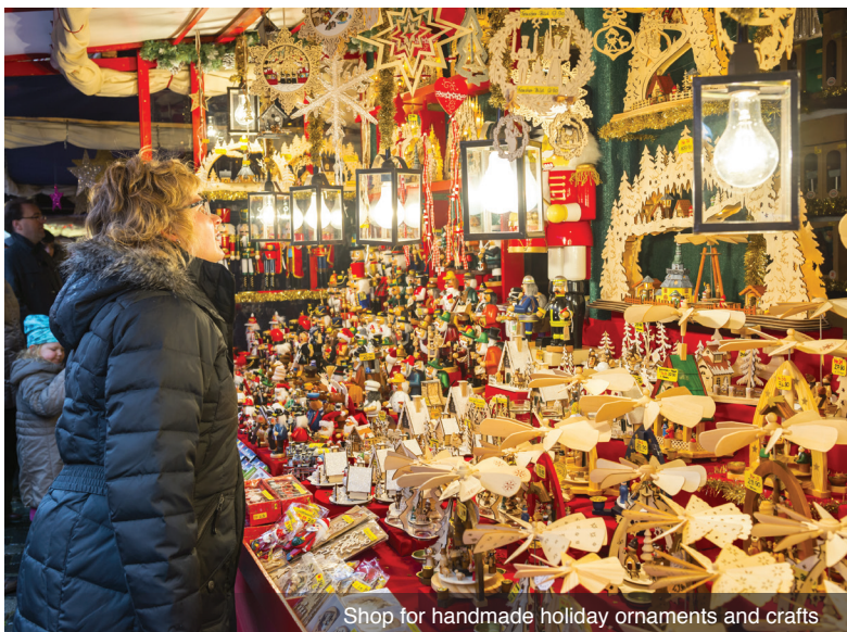
Shop for handmade holiday ornaments and crafts

Days 2 through 8 – Aboard an Emerald Cruises Star-Ship