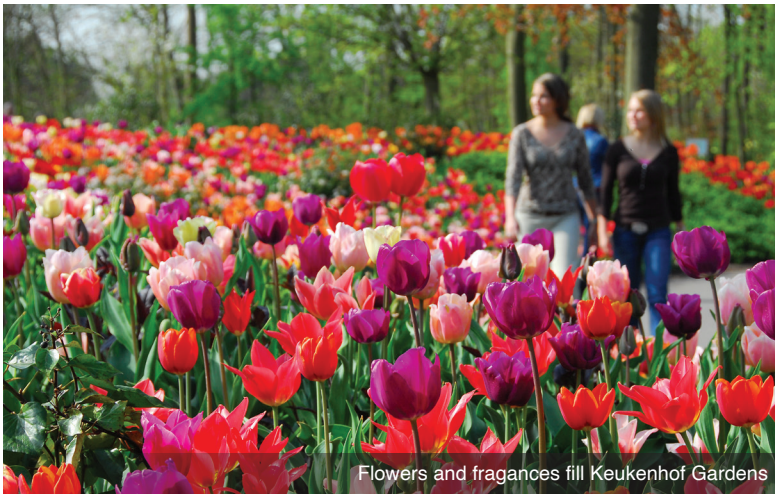
Flowers and fragrances fill Keukenhof Gardens

where the 2 rivers meet, the Church of Our Lady, and visit the Ehrenbreitstein Fortress by cable car on the opposite side of the river. This fortress was part of the Prussian defense against the French in the 19th century and later used as a headquarters for the American military during WWII.