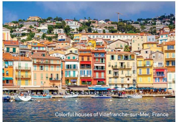
Colorful houses of Villefranche-sur-Mer, France

The itinerary is a guide only and may be amended for operational reasons. As such Mayflower & Scenic cannot guarantee the tour will operate unaltered from the itinerary stated above. Please refer to our terms and conditions for further information.