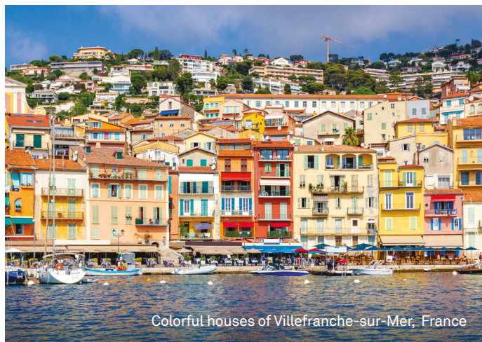
Colorful houses of Villefranche-sur-Mer, France

The itinerary is a guide only and may be amended for operational reasons. As such Mayflower & Scenic cannot guarantee the tour will operate unaltered from the itinerary stated above. Please refer to our terms and conditions for further information.