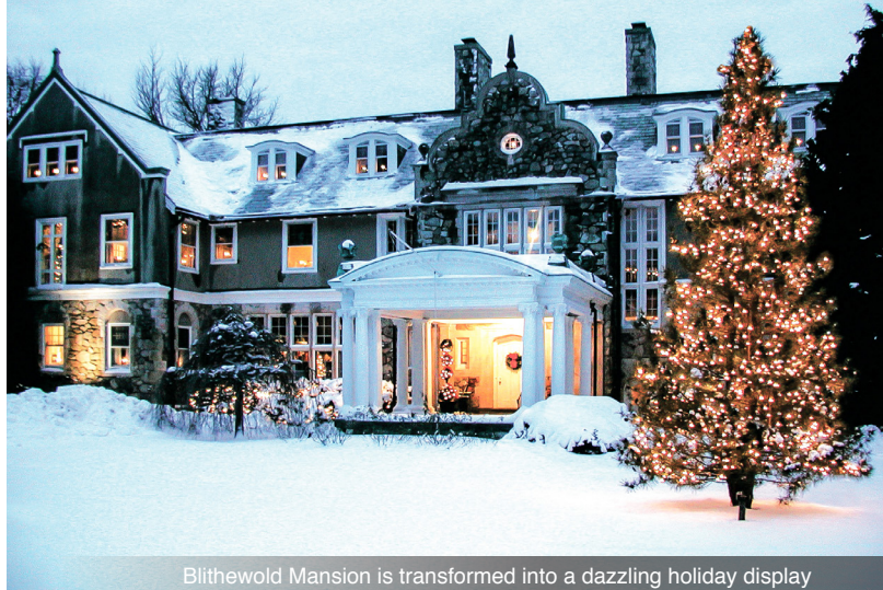
Blithewold Mansion is transformed into a dazzling holiday display

Exclusions: Mayflower Cruises & Tours reserves the right to alter its refund and cancellation policy when a substantial amount of cancellation or postponement of travel is attributable to: conditions resulting from an act of God, natural or man-made disaster, fire, government action, civil disorder, war, hostilities between nations, or unavailability of transportation through no fault of Mayflower Cruises & Tours.